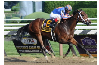
Turbulent Descent

Turbulent Descent (Congrats) proved worthy of her leading role in yesterday's GI Ballerina S. at Saratoga, earning an automatic berth into the GI Breeders' Cup Filly & Mare Sprint Nov. 2 with a convincing 1 1/4-length success from Derwin's Star (Wildcat Heir) for new connections. Purchased by the Coolmore contingent from Blinkers On Racing Stable, et al in June, last year's GI Test S. heroine justified her 2-5 favoritism in this first go for leading trainer Todd Pletcher with a stalk-and-pounce trip from off a slow pace set by eventual third-place finisher All Due Respect (Value Plus). Perched three wide while racing in the second flight early, the bay put a head in front at the top of the lane while ridden confidently by John Velazquez and was never seriously threatened by the late-charging runner-up while becoming a millionaire in the process. "I thought she ran well," said Pletcher. "Sometimes the hardest races to win are the ones you're expected to. We were just hoping to stay out of trouble... Johnny said she got a bit of a bump in the middle of the turn over there and she kind of grabbed him and took off a little sooner than he wanted to. She seems like the kind of filly that, once she makes the lead, tends to wait a little bit, which we anticipated, but we're happy she got it done." Cont. p3