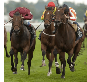
Ortensia