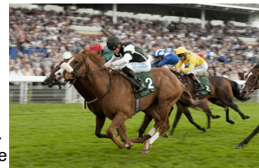
Blaine