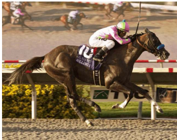
Rolling Fog