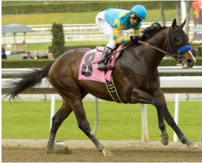
Bodemeister