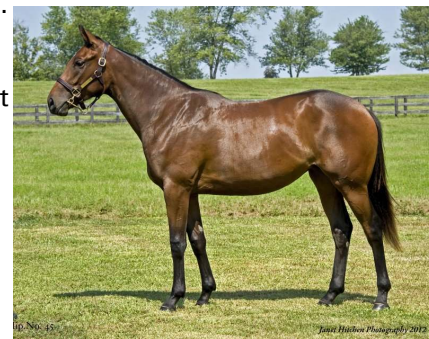
Hip 45 Smart Strike -- Untouched Talent