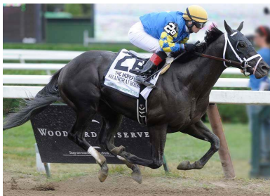
Shanghai Bobby