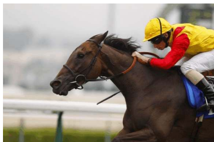
Snow Fairy