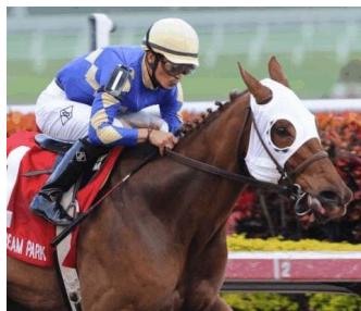
It’s Me Mom