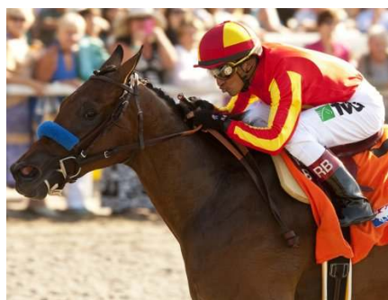
$23,000 KEESEP grad Executiveprivilege