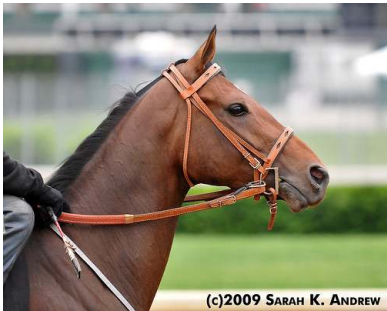
Mine That Bird