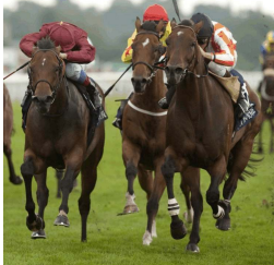
Ortensia