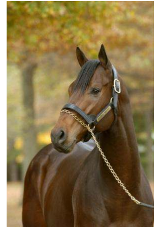
Roman Ruler