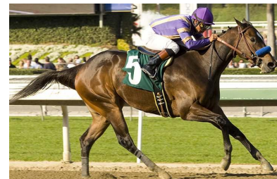
$120,000 KEESEP grad Mamma Kimbo