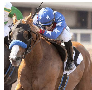
Blueskiesnrainbows