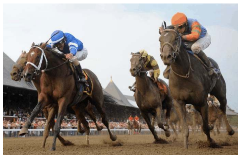
Alpha (blue cap) & Golden Ticket (orange) hit the wire together in the Travers

The Pennsylvania Derby will be a rematch for Alpha with Golden Ticket (Speightstown), who dead-heated in the GI Travers S. at Saratoga Aug. 25.