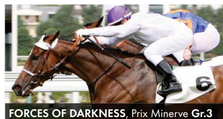
FORCES OF DARKNESS, Prix Minerve Gr.3