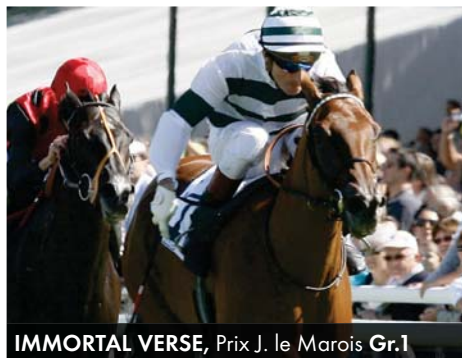
IMMORTAL VERSE, Prix J. le Marois Gr.1