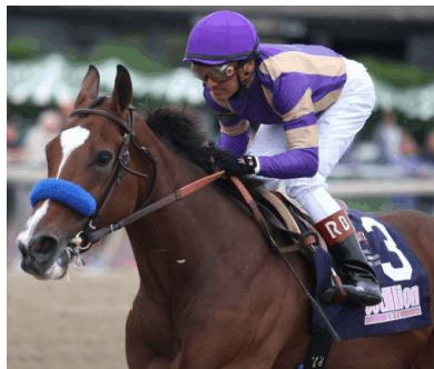
Plum Pretty

Plum Pretty has bankrolled over $1.6 million to date. In addition to her top-level successes, the bay was