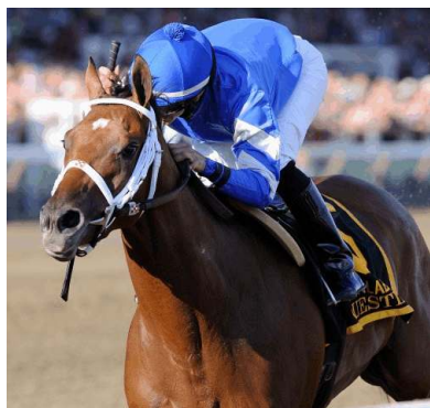
Questing