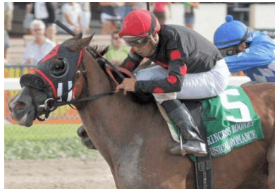
Musical Romance