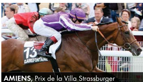
AMIENS, Prix de la Villa Strassburger