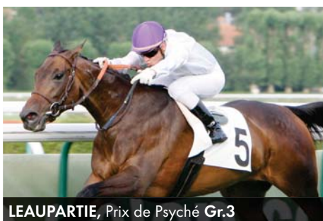
LEUPARTIE, Prix de Psyché Gr.3

By promising first season sire Stormy River and from a lovely Lagardère family, LEUPARTIE ran for the first time at three: deemed good enough to run in the Prix de Diane, she ran brilliantly in spite of her inexperience, finishing sixth. Stepping up a grade, she then took the Prix de Psyché ( Gr.3 ) ahead of Romantica and then finished second over the same distance (2000m) at Deauville in the Prix de la Nonette ( Gr.2 ). A very attractive, lightly raced filly with a faultless race record, she has only had five runs and is an exciting racing prospect as well as broodmare prospect.