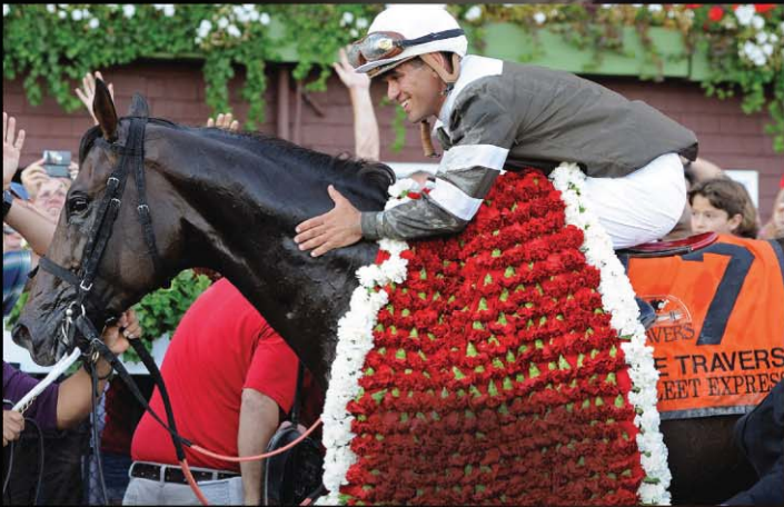
Travers S.-G1 Winner Afleet Express , by Afleet Alex

2 Grade 1 Wnrs, 1 Champion, 1 Breeders' Cup Wnr, 8 GSWs, and 18 SWs