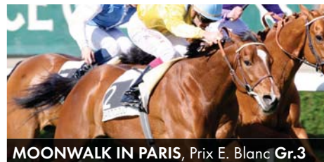
MOONWALK IN PARIS, Prix E. Blanc Gr.3