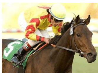
Turbulent Descent

Saturday's GII Gallant Bloom H.--a "Win and You're In" race for the Nov. 2 GI Breeders' Cup Filly & Mare Sprint at Santa Anita--has drawn a strong, 10-horse field including Turbulent Descent (Congrats), who was