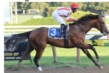
Spurious Precision