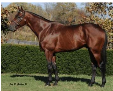
Divine Park

A colt from the second crop of GI Met Mile winner Divine Park (Chester House) was knocked down for session-topping bid of $110,000 on the penultimate day of bidding at the Keeneland September Sale in