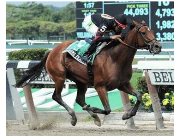
Awesome Feather