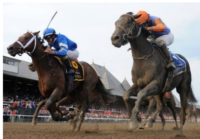
Alpha (inside) and Golden Ticket dead heat in Travers

There was nothing separating Alpha (Bernardini) and Golden Ticket (Speightstown) after 10 furlongs around the Saratoga main track in the GI Travers S. Aug. 25, and the pair of sophomores will look to settle that score in Parx's $1-million GI Pennsylvania Derby. The former, beaten a neck in the GI Wood Memorial S. in April and winner of the GI Jim Dandy S. at the Spa July 28, entered the "Midsummer Derby" with a much more decorated resume than his fellow winner, and