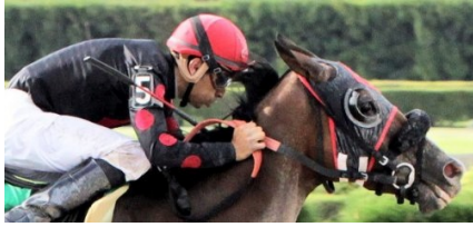
Musical Romance

Today's GII Gallant Bloom H. at Belmont Park, a "Win and You're In" qualifier for the GI Breeders' Cup Filly & Mare Sprint, should provide a nice preview for that championship event. Last year's winner Musical Romance (Concorde's Tune) and last year's favorite Turbulent Descent (Congrats) both line up here.