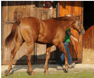
Lot 8 - Sea the Stars colt