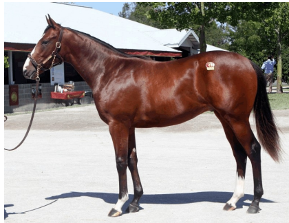
Taylor Made's hip 41, a $1-million son of Street Cry