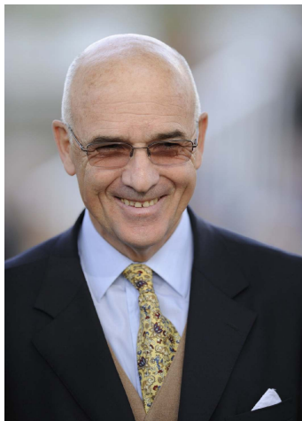
Alain de Royer Dupre