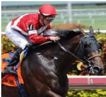
Fort Larned

Fort Larned (E Dubai), winner of the Aug. 4 GI Whitney Invitational H., turned in his final serious work Sunday morning at Belmont in advance of