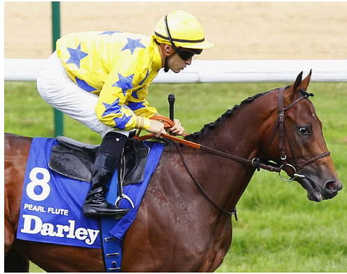
Pearl Flute