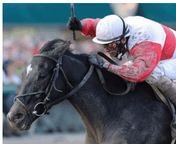
Hymn Book

Hymn Book (Arch) covered a half mile in a quick :46.91, the fastest of 18 moves at the distance over Belmont's main track yesterday. The 6-year-old, who registered his most recent win in the Feb. 11 GI Donn H., finished fourth last time out in the aforementioned Whitney.