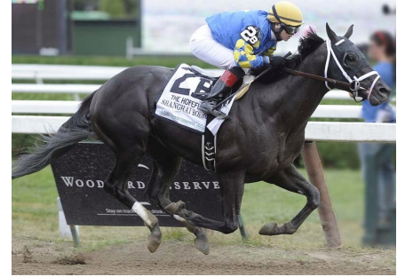
Shanghai Bobby