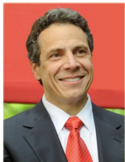
Gov. Andrew Cuomo

Three weeks after the 144th season of racing in Saratoga ended, speculation was replaced by news Monday when state officials said that the bill authorizing the state takeover of NYRA will be signed by Governor Andrew M. Cuomo this week. The signing will be followed by the naming of the members of the temporary reorganization board of NYRA and the newest incarnation of NYRA. Trustees of the beleaguered association agreed in May to allow the state--which will appoint 12 of the 17 members of the new board--to control the association, which has a 25-year franchise agreement.