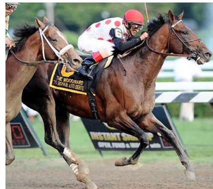
To Honor and Serve holds off Mucho Macho Man (Macho Uno) in Woodward