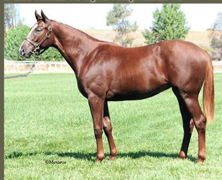
Hip 180: f. TAPIT - SCENERY CHANGE

featuring Cal-breds by Leading Sire TAPIT