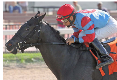
Brave Dave

Brave Dave showed promise as the 2-1 gate-to-wire winner on debut at this track and trip June 30. He tired to fourth in Saratoga's GII Sanford S. July 22 after drifting out in the stretch, but came back from a stumbling start to wire the GIII Saping S. at Monmouth Sept. 2. Quickly out of the gate here, the favorite took the lead and stayed ahead throughout, setting fractions of :21.51 and :45.03, before increasing his lead in the stretch.