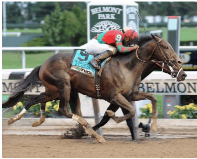
Flat Out

Preston Stables LLC's Flat Out (Flatter) added his name to an elite group of horses including Nashua, Kelso, Creme Fraiche, Skip Away and Curlin in successfully defending his title in the prestigious GI Jockey Club Gold Cup, a "Win and You're In" event for the GI Breeders' Cup Classic. The athletic 6-year-old ran down pacesetter Stay Thirsty (Bernardini) in the final strides, with GI Whitney H. hero Fort Larned