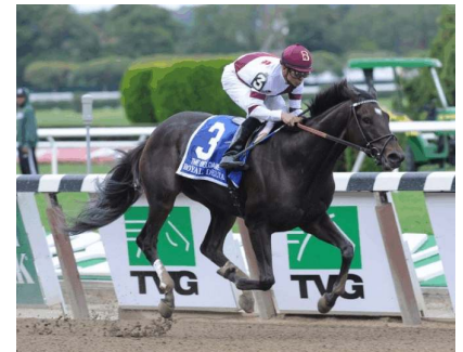
Royal Delta