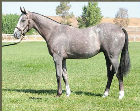
Hip 93: c. TAPIT - HELLUVA HOOLEY

LIBERTY ROAD STABLES, HAVENS BLOODSTOCK AGENCY, INC., AGENT