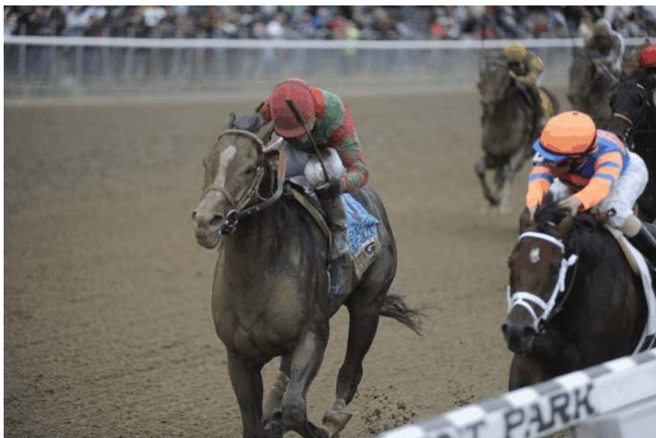
Flat Out (left) bests Stay Thirsty