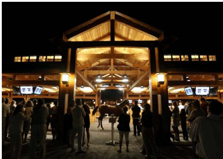
The Fasig-Tipton Saratoga walking ring at night

Fasig-Tipton used to hold a horses-in-training sale at Belmont, but last did so in 2004. The auction house has been looking to revive the concept.