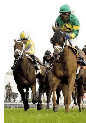
Spring in the Air (left) completes an exactor for her sire in the Natalma