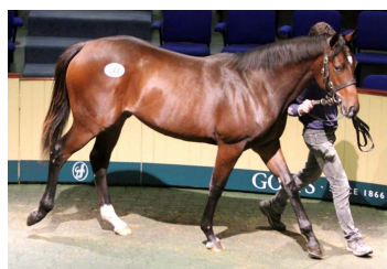
Lot 377

The pre-eminence of Galileo (Ire) at Goffs' Orby Sale is well-established and the Coolmore giant stole the show late on yesterday when his half-brother to Lahaleeb (Ire) (Redback {GB}) topped the latest renewal at a regal €800,000 ($1,041,067). As the afternoon began to slip into evening, there was a sense of