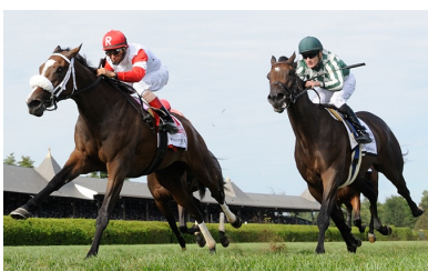
Stephanie's Kitten takes Lake Placid

This year's group of U.S.-based 3-year-old filly turfers have taken turns beating each other all year, and nobody would be a surprise in the G1 Queen Elizabeth II