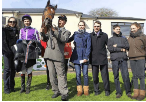
Excelebration

Frankel (GB) (Galileo {Ire}) may be the star attraction on Saturday's QIPCO Champions Day card at Ascot, but the undercard is dotted with talent aplenty. Excelebration (GB) (Exceed and Excel {Aus}) and Cityscape (GB) (Selkirk) take on the filly Elusive Kate (Elusive Quality) in the G1 Queen Elizabeth II S., while G1 Investec Oaks heroine Was (Ire) (Galileo {Ire}) and G1 Irish Oaks victress Great Heavens (GB) (Galileo {Ire}) will