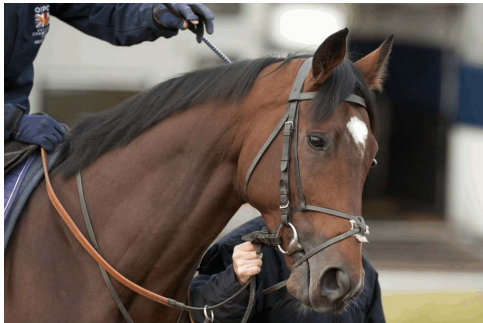
Frankel

Ascot received further rainfall into Thursday, leaving Sir Henry Cecil pondering the implications for Khalid Abdullah's Frankel (GB) (Galileo {Ire}) in tomorrow's G1 QIPCO Champion S. Despite remaining generally upbeat about the prospects of the 4-year-old remaining unbeaten after his probable finale, the master of Warren Place is hopeful that there was no further deterioration