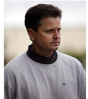
Al Stall Jr. Horsephotos

The chestnut established a new track record for six furlongs at Keeneland when stopping the clock in 1:07.76 in her unveiling last fall ( video ), then kept her perfect record intact with an equally impressive six-length triumph as the 1-9 favorite in a $50,000 optional tagger at Fair Grounds in December ( video ). Applauding was scratched the morning of the Silverbulletday S. in January after displaying colic-like symptoms.