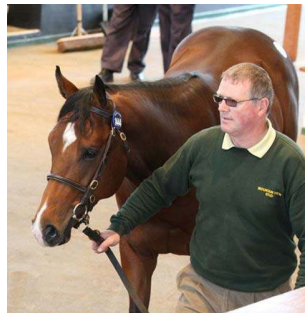
Lott 1444