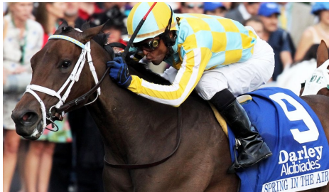
$50,000 FTKOCT grad Spring in the Air

Kenny Troutt's WinStar Farm has done its best to be a booster for the Fasig-Tipton Kentucky Fall Yearlings Sale of late. In addition to standing the stallions that sired successful 2012 graded-winning grads Ellafitz (Tiznow) and All Squared Away (Bellamy Road),