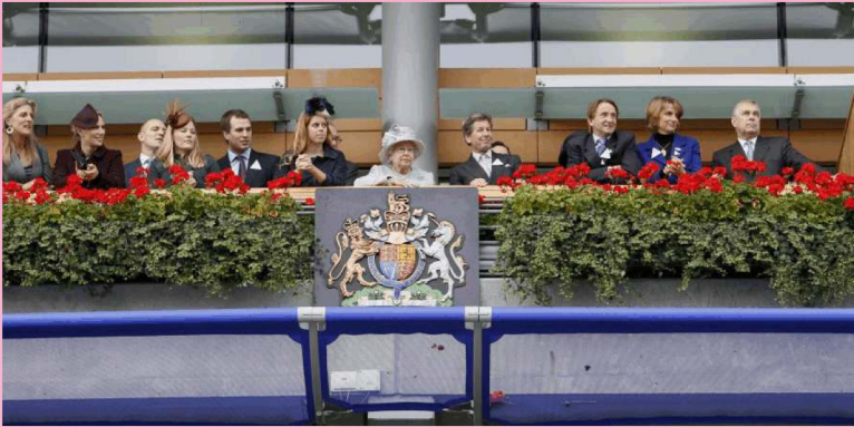
The Queen awaits Frankel