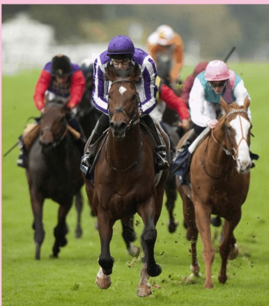
Excelebration highlights the undercard