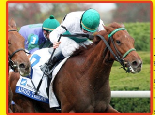
3yo filly ANGEL TERRACE 1st Gill Pin Oak Valley View S. at Keeneland 10/19