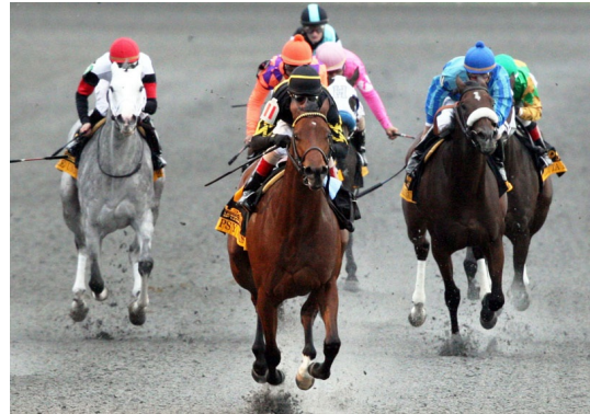
Gypsy Robin leaves her foes in the dust

Gypsy Robin resurfaced going an extended seven panels in the GII Beaumont S. here in April, and led through soft splits to best Sacristy by three lengths. She followed up with another synthetic tally in Presque Isle's Inaugural S. in May, but faltered to sixth in Belmont's GIII Victory Ride S. July 7. She was coming off a runner-up finish behind Contested (Ghostzapper) in the Spa's GI Test S. at this distance Aug. 25, and showed a very upbeat series of drills locally since that last outing. Straight to lead from the 10 hole in what seemed like a large and well-matched group, the 6-5 choice doled out splits of :22.17 and :45.30. Pilot John Velazquez peaked back at that point, gave Gypsy Robin a shake of the reins and steadily built on her advantage from there in no-doubt-about-it fashion.