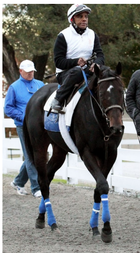
The WinStar-bred GISW Golden Ticket yesterday at Keeneland

Now, WinStar returns to Newtown Paddocks with a big 17-horse group for FTKOCT, selling between Taylor Made Sales and Denali. Several in the group have nice updates, but none more so than hip 859 , a colt by Any Given Saturday whose WinStar-bred half-brother Golden Ticket (Speightstown) dead-heated for the win in the GI Travers S. at Saratoga. Golden Ticket is expected to appear next in the GI Breeders' Cup Classic at Santa Anita. Both horses were produced by the Deputy Minister mare Business Plan. Taylor Made consigns the Mar. 16-foaled chestnut.