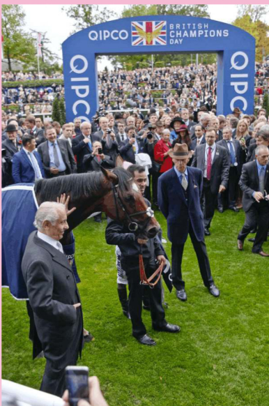
Prince Khalid Abdullah greets his champ