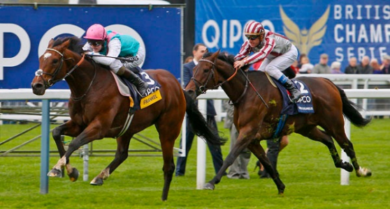
Frankel best Cirrus des Aigles Racing Post

He faced real adversity for the first time in his glory-strewn career yesterday, but Khalid Abdullah's greatest gift to racing Frankel (GB) (Galileo {Ire}) duly overcame unfavorable testing ground and a blown start to sign off victorious in yesterday's G1 QIPCO Champion S. at Ascot. He had long been targeted at the £1.3-million