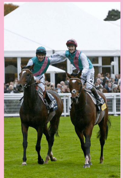
brothers from a different father