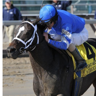
It's Tricky