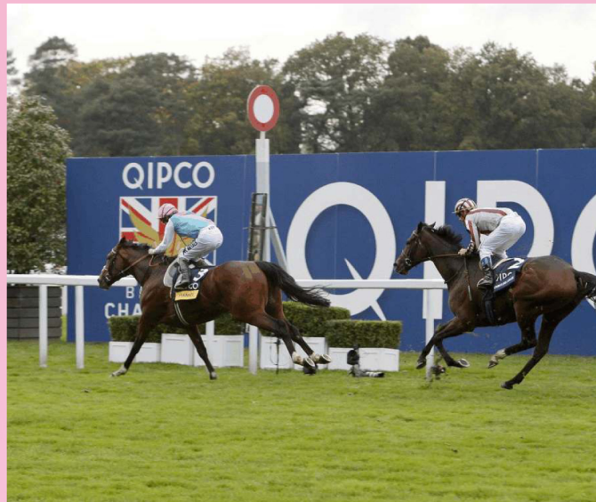
Frankel, first (again)