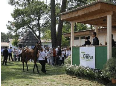
Auction at La Teste-de-Buch

Tattersalls announced that they have formed a strategic alliance with the French sales company Osarus. Tattersalls revealed that they will provide logistics and personnel, as well as administrative and financial support to the firm, which currently stages four auctions annually, including a breeze-up at Pornichet and a yearling sale at La Teste-de-Buch.