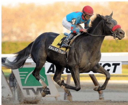
Called to Serve (Afleet Alex) rises in GIII Discovery