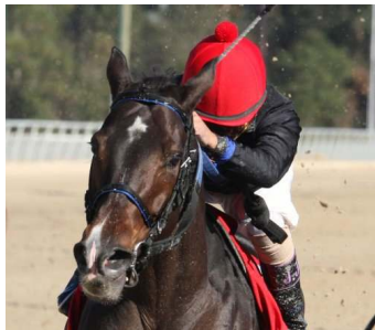
Bella Medaglia