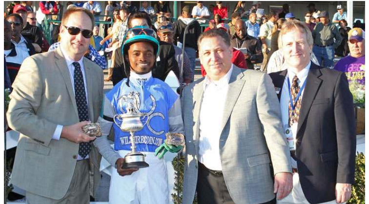
The winning Jackpot connections