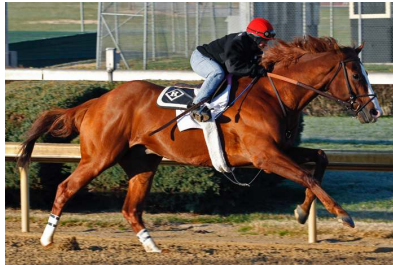
Shackleford