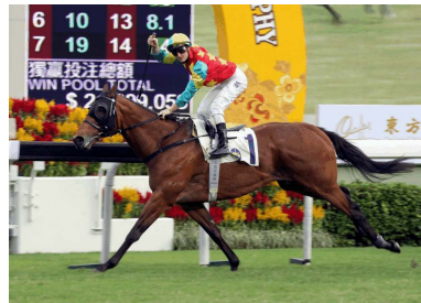
Ambitious Dragon

Races in three weeks' time, and today's G2 Longines Jockey Club Mile will have a big say in where the dual Horse of the Year ultimately shows up. Beaten a short head by Destined for Glory (Ire) (Azamour {Ire}) as the 2-5 chalk in this event last year, the 'Dragon' pressed on to the