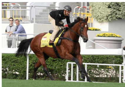
Super Easy HKJC.com