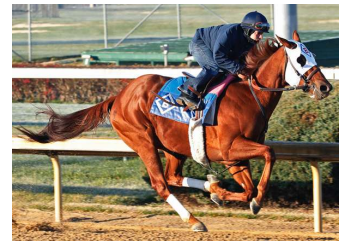
Groupie Doll