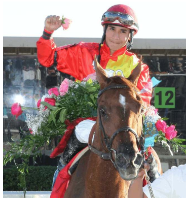
Rose to Gold (Friends Lake) wins GIII Delta Princess