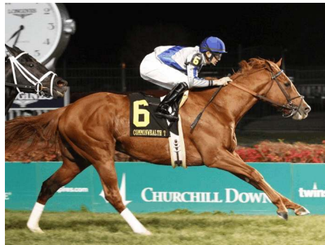
Lea (First Samurai) wins GIII Commonwealth Turf