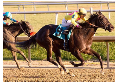
Greed and Fear