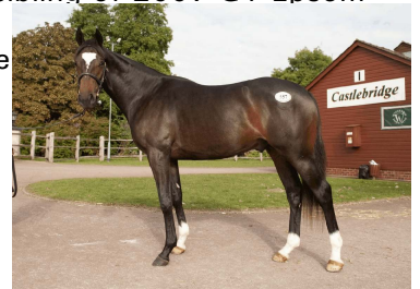
Hydrogen (GB) at Tattersalls