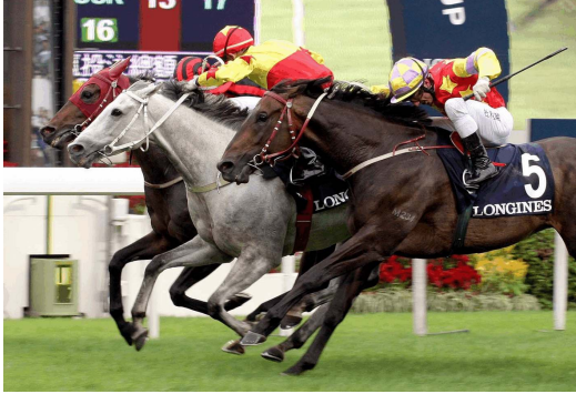
California Memory

Still going strong at the ripe age of 6, California Memory (Highest Honor {Fr}) produced a smart turn of foot late to annex Sunday's G2 Longines Jockey Club Cup at Sha Tin. Reserved off the pace in the early going, the diminutive grey split rivals late to record his first win of the season.