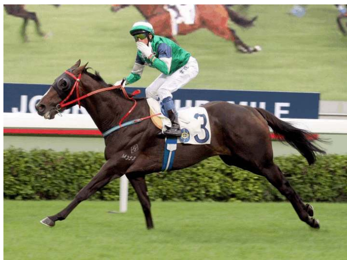
Glorious Days