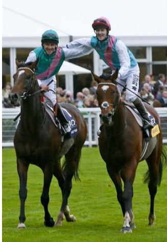
Bullet Train (left) & Frankel