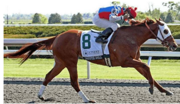
Groupie Doll