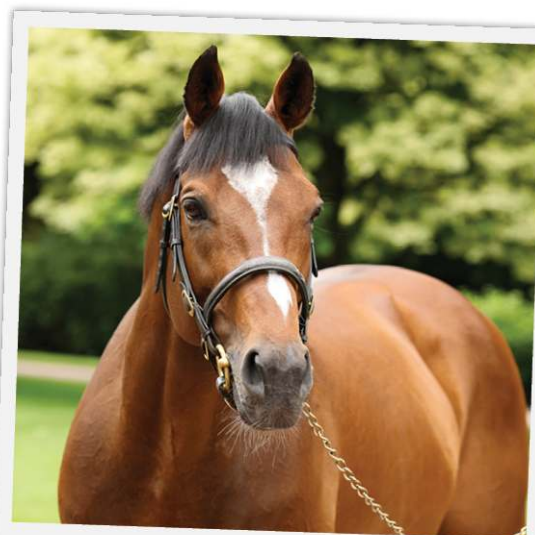
Galileo, sire of 9 individual Gr.1 winners in 2012