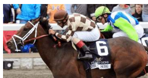
Embur's Song

Headlining the dispersal is Sovereign Award winner Embur's Song (Unbridled's Song--Embur Sunshine, by Bold Ruckus), who captured three graded stakes and won over $616,000 for Fares Farm. The 5-year-old is in foal to Giant's Causeway. Among the Curlin siblings to be offered are Deputy Saint (Saint Liam), a 5-year-old mare in foal to Lemon