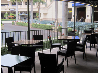
Fountain Club Gulfstream Park

Gulfstream Park will open Saturday, Dec. 1 with more than $1 million in customer-friendly improvements including a new 25-table restaurant overlooking the