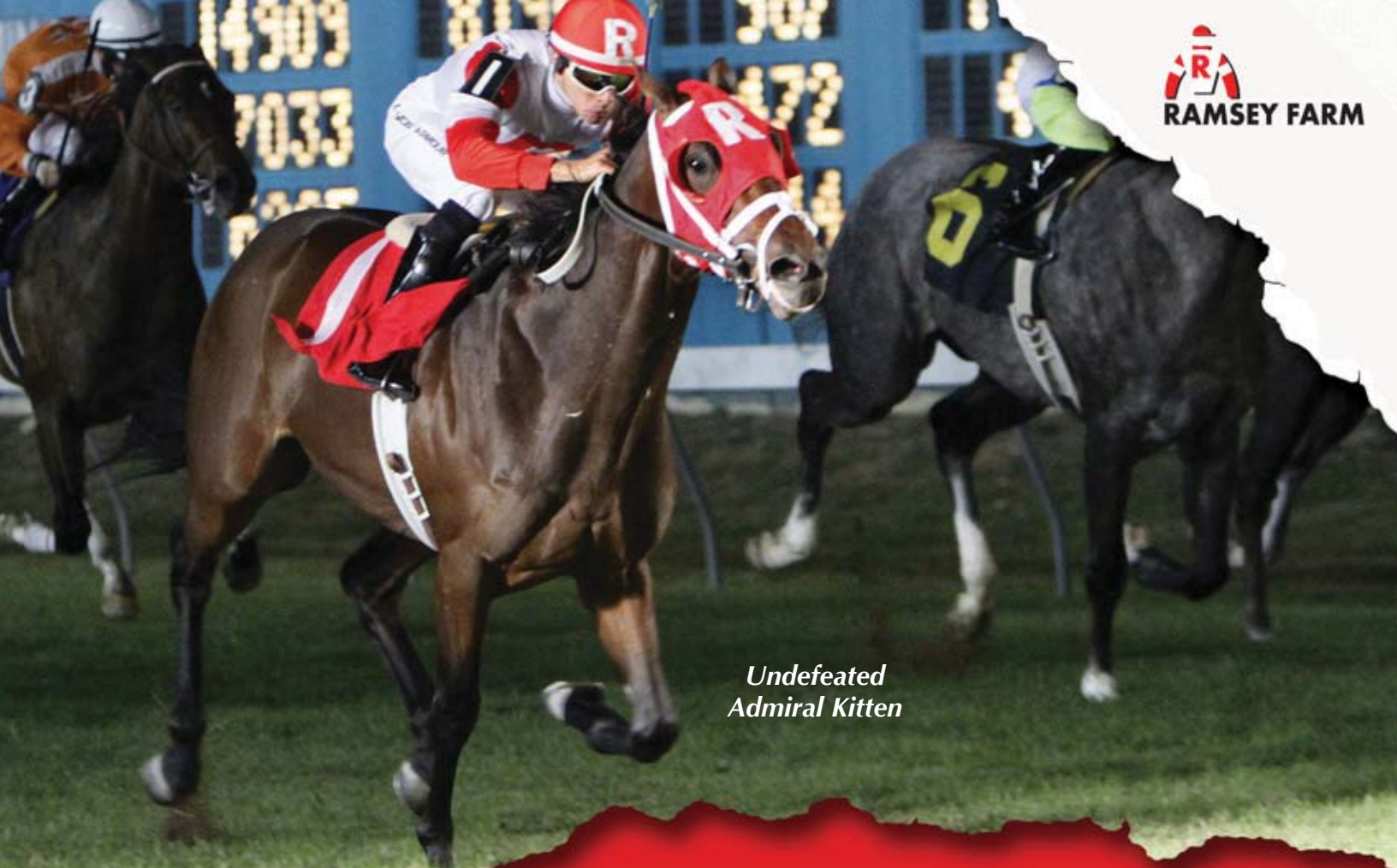
Undefeated Admiral Kitten