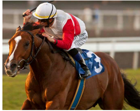
Data Link Benoit