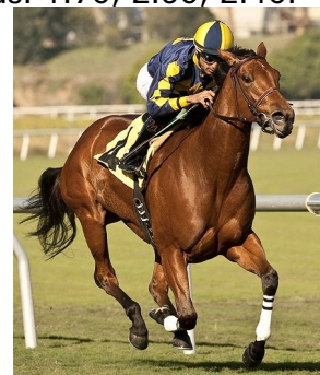
Kindle in the stretch

After finishing off the board in her first two starts of the year, Kindle was put on the shelf for almost eight months. She resurfaced Sept. 21 with a victory in the Bangles and Beads S. at Fairplex, and was most recently second in the Gill Senator Ken Maddy S. in her turf debut on the downhill course at Santa Anita Oct. 20. Taking up the early lead, the favorite kicked clear at the top of the stretch and won handily.