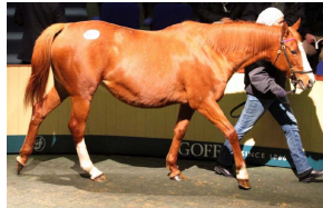
Chelsea Rose Goffs photo