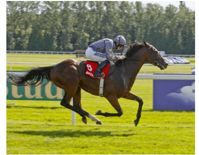
Mount Athos Racing Post