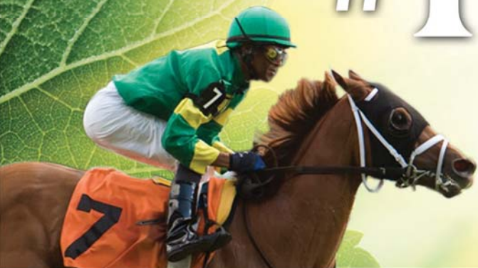
SPRING VENTURE (G2)

by Graded Stakes winners and Stakes winners