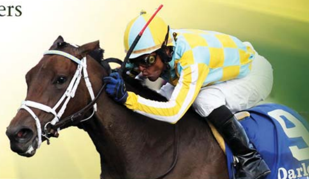
SPRING IN THE AIR (G1)

Sire of 3 GSWs and 4 SWs in his first crop.