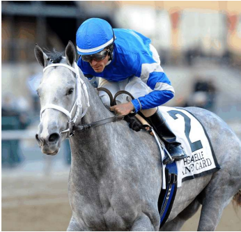
Dance Card (Tapit) wins GI Gazelle S.