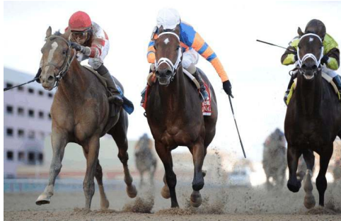
Overanalyze (Dixie Union) (center) wins GI Remsen