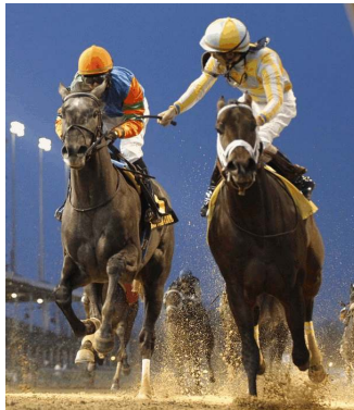
Uncaptured (Lion Heart) (rail) resolute in GI KY Jockey Club