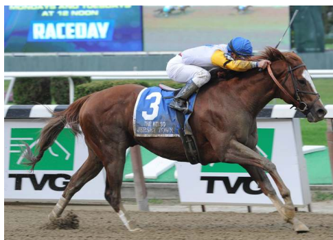
Jersey Town