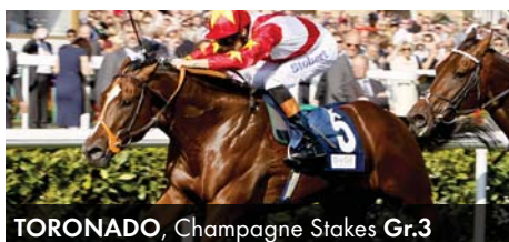
TORONADO , Champagne Stakes Gr.3

2010 Breeding Stock Sale f.00 – Grand Slam x Wedding Gift