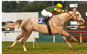
Unbridled Command