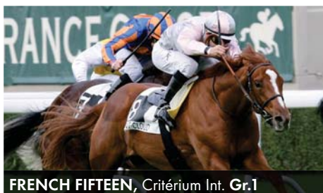
FRENCH FIFTEEN , Critérium Int. Gr.1

2008 Breeding Stock Sale f.98 – Ashkalani x Zarzaya