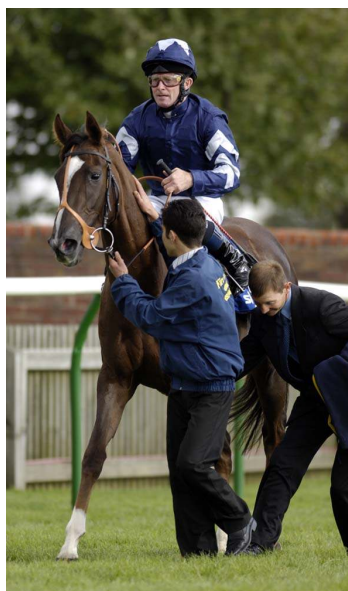
Donna Blini

Height of Fashion (dam of Nashwan, Unfuwain and Nayef) and she visited Busted--a noted source of stamina--to produce Deep Impact's second dam, Burghclere. Burghclere in turn produced Deep Impact's dam Wind In Her Hair, a Group 1 winner over a mile and a half in Germany at four, after finishing second in the Oaks at three.