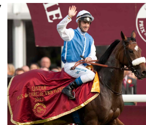
Solemia