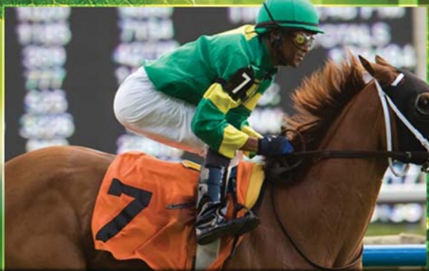
SPRING VENTURE (G2)