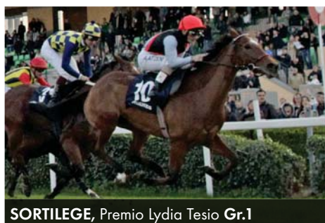
SORTILEGE , Premio Lydia Tesio Gr.1

2011 Breeding Stock Sale f.08 – Tiger Hill x Sahel