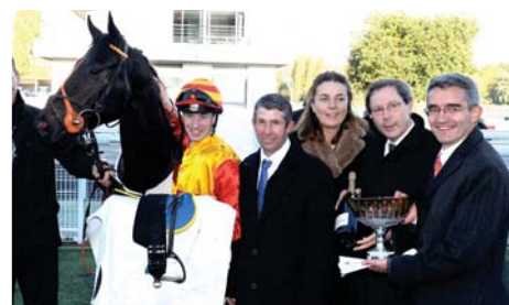
PENNY'S PICNIC , Crit. Maisons-Laffitte Gr.2

2008 Breeding Stock Sale f.05 – Kingmambo x Penny's Valentine