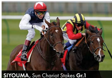
SIYOUMA , Sun Chariot Stakes Gr.1

2011 Breeding Stock Sale f.08 – Medicean x Sichilla