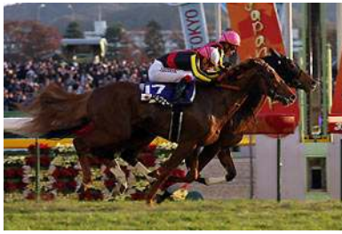
Gentildonna

Gentildonna's sequence of victories has come over a variety of distances, and her versatility--and toughness--brings back fond memories for me of her fifth dam, Fair Astronomer. As an impressionable newcomer to the sport, I was sorely misled by Fair Astronomer as to what it was reasonable to expect any horse to achieve. This unfashionably bred filly earned the title of champion 2-year-old filly in Ireland, with a record of six wins from nine starts, mostly over five furlongs. Although a career as a sprinter seemed to beckon for this daughter of the five-furlong specialist Star Gazer, Fair Astronomer went on to win at up to 1 1/4 miles in a further nine starts at three, when she earned a Timeform rating of 125.