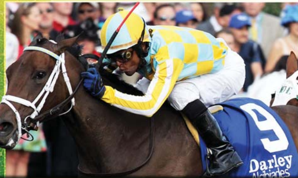
SPRING IN THE AIR (G1)

by Graded Stakes winners and Stakes winners