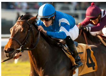
Better Lucky Benoit

Ghostzapper's daughter Better Lucky , winner of the prestigious G1 Matriarch S., has a Grade II-winning daughter of the Breeders' Cup Sprint heroine Desert Stormer as her dam. Even better is Deep Impact's daughter Gentildonna , who became the first sophomore filly ever to take the highly competitive Japan Cup. A sister to the smart Japanese filly Donau Blue , Gentildonna is a daughter of Donna Blini . This winner of the historic G1 Cheveley Park S. was imported to Japan at a cost of 500,000gns at the end of her racing career.