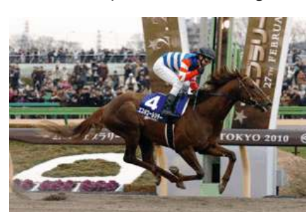
Espoir City

A field of locally based horses will line up for Sunday's G1 Japan Cup Dirt, featuring two past winners of the event. Espoir City (Jpn) (Gold Allure {Jpn}) took down the 2009 running as a 4-year-old, but enters this year's race in arguably career form. Winner