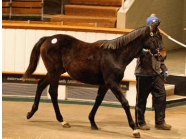
Lot 796 tattersalls.com

Somerset nursery Ashbittle Stud consigned the session topper on another buoyant day of trade at Tattersalls, with their homebred colt by Lawman (Fr) (Invincible Spirit {Ire}), Lot 796 , selling for 120,000gns.