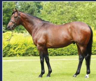
AQLAAM £7,000 (1ST JAN SLF)