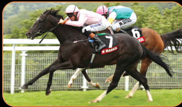
THE FUGUE wins the Gr.1 Nassau Stakes at Goodwood. She remains in training in 2013.

TWYLA THARP's other female relatives retained by the stud are being bred to the best: