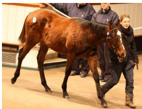
Lot 779 tattersalls.com

Hip 796 sealed a good day for County Kilkenny's Ballylinch Stud, whose resident stallions Lawman (Fr) and Lope de Vega (Ire) (Shamardal) were responsible for three of the four most expensive weanlings sold. There are nine more Lawman foals to be offered during the remaining two days of the sale, and the two sold thus far have both achieved six-figure returns, while the three by first-crop sire Lope de Vega to change hands did so for an average price of 55,000gns. They include the second-top lot ( Lot 779 ), a colt out of black-type producer Woodmaven (Woodman). Denis