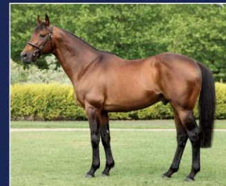
NAYEF £9,000 (1ST JAN SLF)