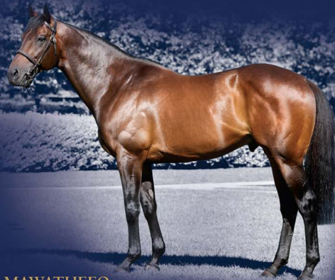
MAWATHEEQ £4,000 (1ST JAN SLF)

Beech House Open Day Monday 3rd December