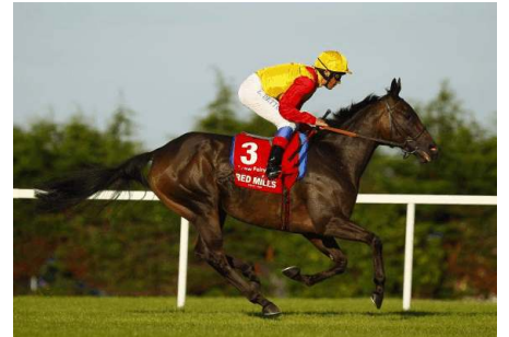
Snow Fairy