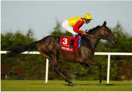
Snow Fairy