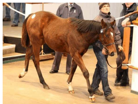
Lot 544 tattersalls.com

Two colts shared the third-top slot with yet more bold pinhookers prepared to go to 110,000gns to secure the sons of Exceed and Excel (Aus) (Danehill)