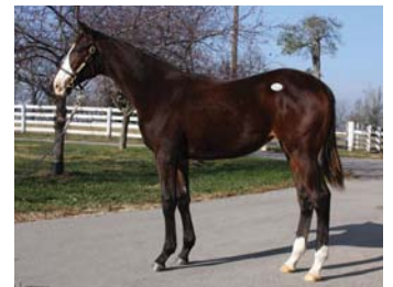
Arch / A True Pussycat