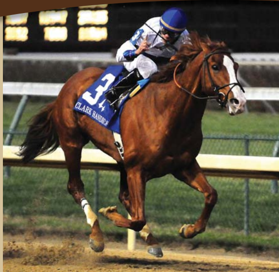
Shackleford caps career with Clark (G1) win