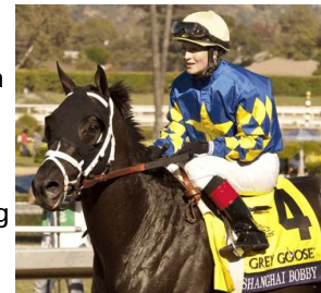
Shanghai Bobby

Committee of the Thoroughbred Owners and Breeders Association conducted its annual grading session Nov. 28 in Lexington, Kentucky. The Hopeful, traditionally the Labor Day closing feature at Saratoga, had been downgraded for 2012, but was restored to its original status for next year. It was won this season by likely champion Shanghai Bobby (Harlan's Holiday).