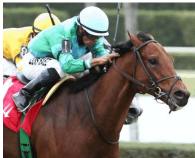
Philly Ace (Smart Strike) closes in GIII Tropical Turf H.