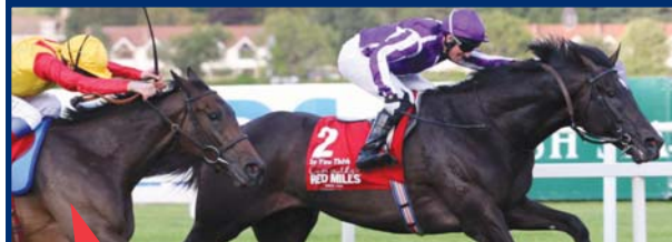
SNOW FAIRY (6 Group 1 wins including the 2012 Irish Champion Stakes-Gr.1)