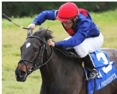
Closing Range (After Market) wins from the front in GIII La Prevoyante H.