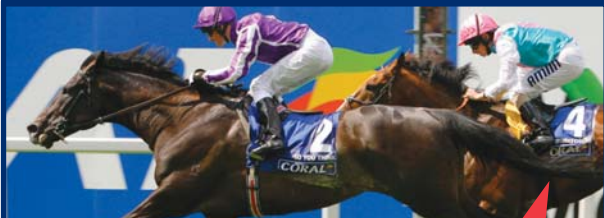
WORKFORCE (European champion 3YO, won Epsom Derby-Gr.1 and Prix de l'Arc de Triomphe-Gr.1)