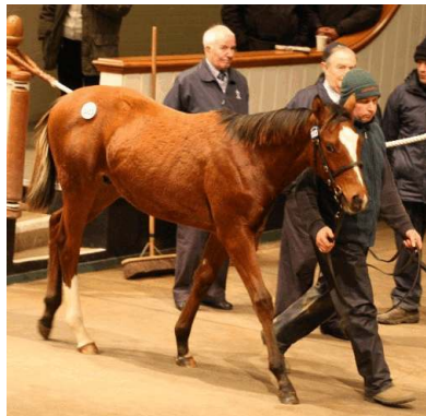
Lot 1023 - Galileo colt www.tattersalls.com

A brother to 2010 G1 Derby runner-up At First Sight (Ire) (Galileo {Ire}) (lot 1023) got the vote over a raft of well-bred and expensive fillies when surging to the top of the table at Tattersalls late on Friday. The Galileo weanling was bought by Sheikh Fahad Al-Thani for 500,000gns (US$840,577).