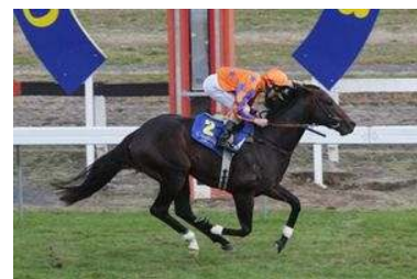
Burgundy winning the G3 Breeders' S.

The blue-blooded Burgundy (NZ) (Redoute's Choice {Aus}) made a smashing return from an April layoff, streaking away to land the Listed Levin S. Friday at Otaki. The 4-year-old, a 3/4-brother to the outstanding Darci Brahma (NZ) (Danehill), fetched NZ$1.3 million at the 2010 Karaka Premier Yearling Sale, second-highest price of the auction, and was having his first run since a victory in the G3 Breeders' S. at