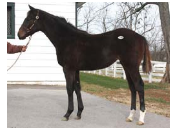
Lemon Drop Kid / Missing Miss