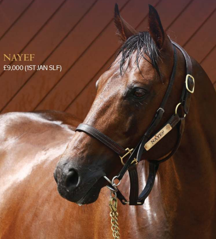
NAYEF £9,000 (1ST JAN SLF)

Map to Beech House Stud: tinyurl.com/cqshua2