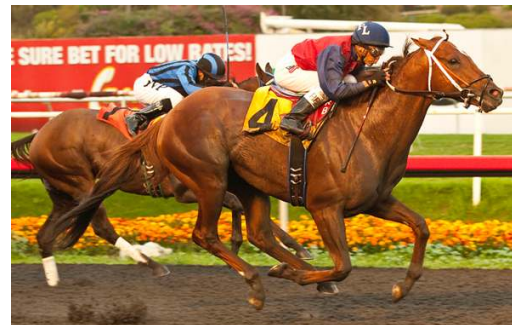
Smiling Tiger overtakes Private Zone