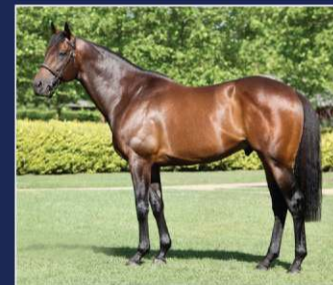
MAWATHEEQ £4,000 (1ST JAN SLF) First foals in 2012

Pop over to Beech House Stud, Cheveley Road to see the Shadwell Stallions today from 10am to 3.30pm.