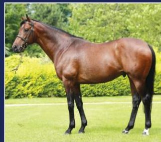
AQLAAM £7,000 (1ST JAN SLF) First yearlings in 2012

VIEW THE STALLIONS AT BEECH HOUSE STUD, NEWMARKET