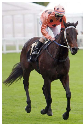
Black Caviar