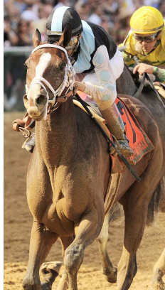
In Lingerie