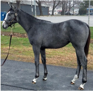
Hip 156

MIDLANTIC SALE A weanling half-sister to recent GI Hollywood Derby winner Unbridled Command (Master Command) attracted top price of $100,000 during Monday's Fasig-Tipton Midlantic December Mixed Sale in Timonium. Figures, as expected, were down across the board when compared to last year's sale, which was bolstered by the Flying Zee Stable dispersal. Yesterday, 140 head grossed $1,150,200. The average of $8,216 fell 42.9% from 2011, when 260 horses sold for $3,739,350 and an average of $14,382.