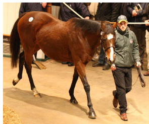
Twyla Tharp

Lord and Lady Lloyd Webber's Twyla Tharp (Ire) (Sadler's Wells) ( lot 1511 ), dam of this year's