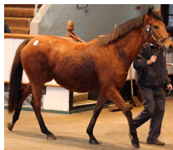
Sapphire Pendant

Sumoto was bought the December before her son Summoner (GB) (Inchinator {GB}) won the G1 Queen Elizabeth II S., becoming the second top-level winner for his dam after Eclipse Stakes winner Compton Admiral (GB) (Suave Dancer). Twyla Tharp was herself runner-up in the G2 Ribblesdale Stakes, a performance echoed this season by The Fugue, who was also placed in the Oaks before securing her major victory at Glorious Goodwood.