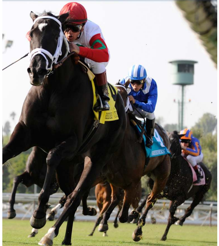
Breeders' Cup Photo ©

"I love this site! It is incredibly helpful to have one site that you can go to for all of the information that owners need on a regular basis. Nice job!"