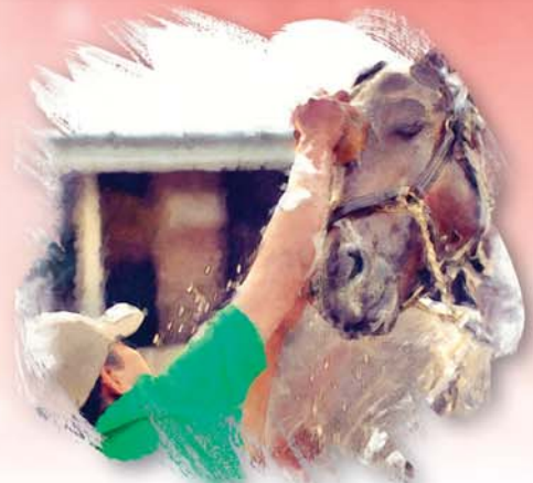
Backstretch and Education Programs