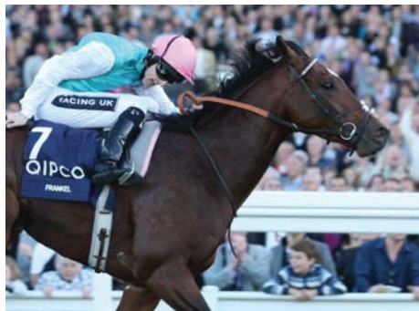
Frankel (GALILEO) 2,000 Guineas-Gr.1 in 2011