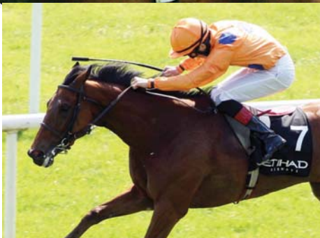
Samitar (ROCK OF GIBRALTAR) Irish 1,000 Guineas-Gr.1 in 2012