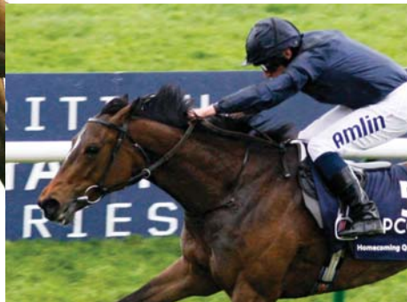
Homecoming Queen (HOLY ROMAN EMPEROR) 1,000 Guineas-Gr.1 in 2012