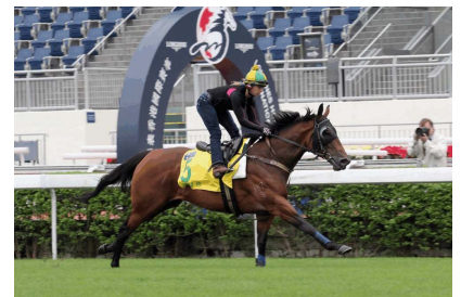
Sea Siren

Sea Siren (Aus) (Fastnet Rock {Aus}) will try to take the prize back to Australia for the first time since Falvelon (Aus) posted back-to-back victories when it was held up the 1000-meter straight in 2000 and 2001. The 4-year-old filly may not be in the same category as Black Caviar (Aus) (Bel Esprit {Aus}), but she is an accomplished racehorse all the same.