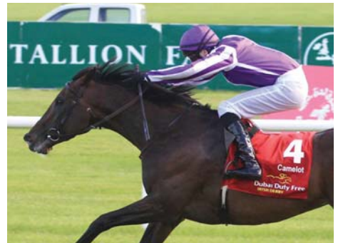
Camelot (MONTJEU) 2,000 Guineas-Gr.1, Epsom Derby-Gr.1 & Irish Derby-Gr.1 in 2012