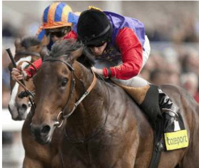
Carlton House