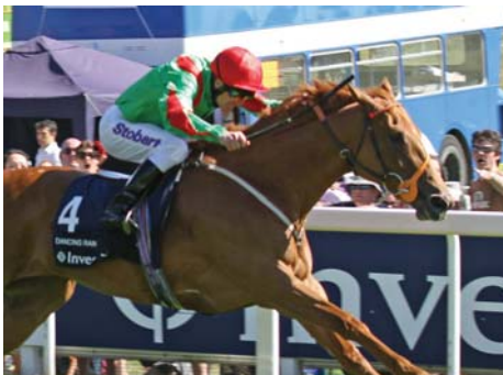
Dancing Rain (DANEHILL DANCER) Epsom Oaks-Gr.1 in 2011