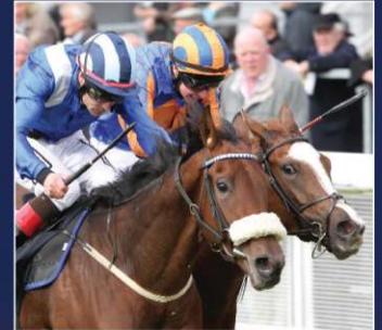
SALHOODA battling to defeat the Galileo half-sister to Giant's Causeway in a hot maiden at The Curragh.