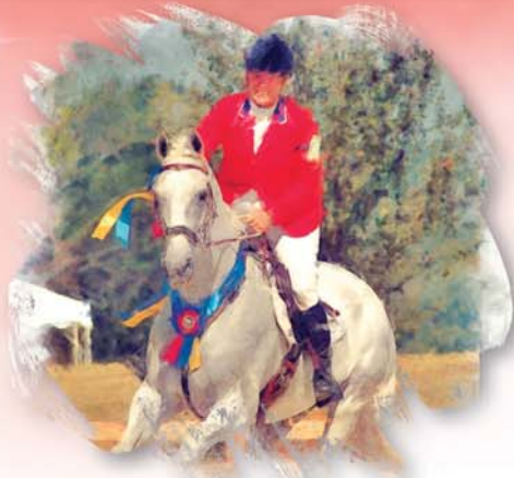
Rescue, Retirement and Adoption Programs