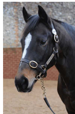
Blue Symphony