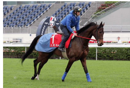
Cirrus des Aigles

For all his talent and worldwide success, Cirrus des Aigles (Fr) (Even Top {Ire}) , the 130 top-rated horse at this year's Longines Hong Kong International Races, has run his fair share of bad luck in three previous trips to the Far East. Fifth in the 2009 G1 Hong Kong Vase, the 6-year-old was no better than seventh to Snow Fairy (Ire) (Intikhab) in the 2010 G1 Hong Kong Cup and found some trouble when fifth, two lengths behind California Memory (Highest Honor {Fr}) as the 24-10 second choice in last year's running. Cirrus will have every chance to turn the tables on his rival this season, and enters the Cup in arguably the best form of his career.