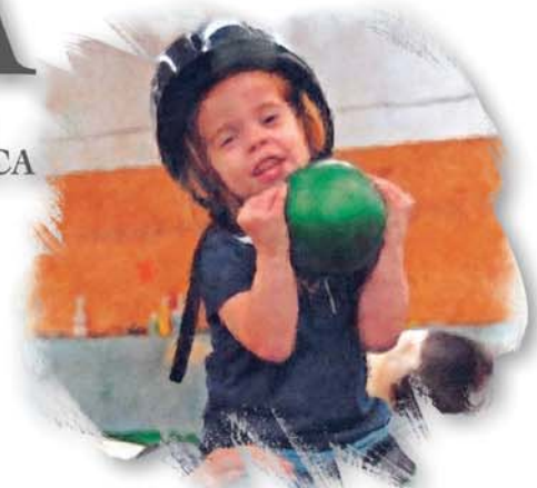
Therapeutic Riding Programs