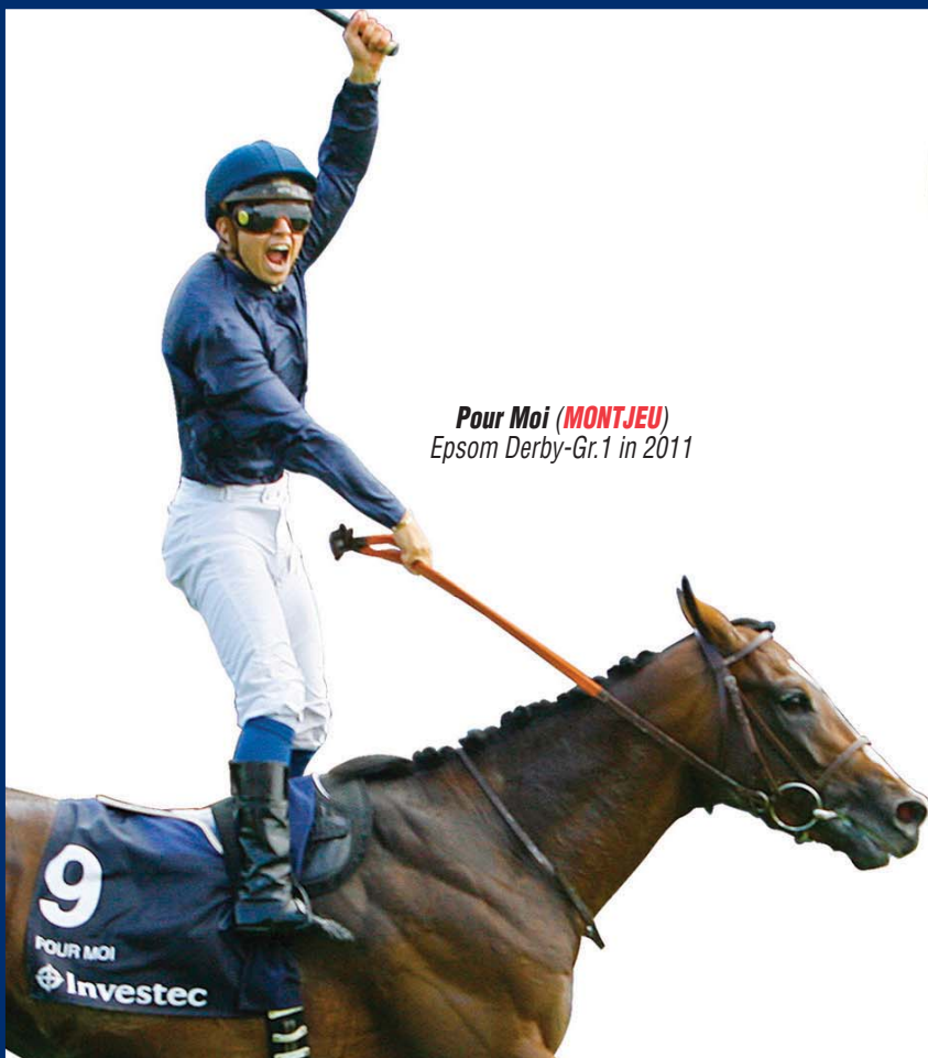
Pour Moi (MONTJEU) Epsom Derby-Gr.1 in 2011

of the Classics in Britain & Ireland in the last two years were won by Coolmore sired horses including: