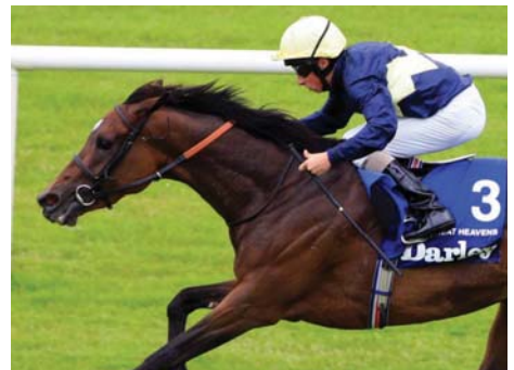
Great Heavens (GALILEO) Irish Oaks-Gr.1 in 2012