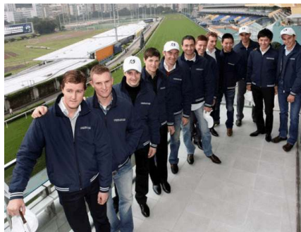
The 12 jockeys for tonight's IJC Tuesday at Happy Valley HKJC.com