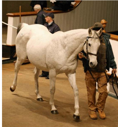
Claba di San Jore