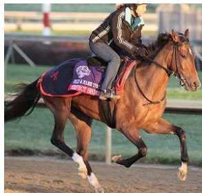
Perfect Shirl

Charles Fipke's Perfect Shirl (Perfect Soul {Ire}), winner of the 2011 GI Breeders' Cup Filly & Mare Turf, is on the comeback trail, according to trainer Roger