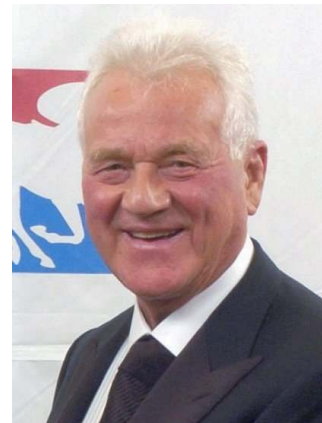
Frank Stronach

A 10-year agreement for sustained racing at Pimlico Race Course and Laurel Park has been reached by the Maryland Jockey Club, the Maryland Thoroughbred Horsemen's Association and the Maryland Horse Breeders Association, it was announced Friday. The 2013 racing season will feature 146 days of live racing, and the deal also calls for Pimlico and Laurel to remain open for year-round racing, training and stabling for the balance of the contract. "I am confident and pleased via this agreement," Stronach Group Chairman Frank Stronach commented.