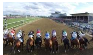
Pimlico Race Course: Home of the GI Preakness S.

"We will now have long-term stability, year-round racing and stabling, an attractive purse structure, promise for the breeding industry and a strong foundation to restore Maryland racing to its