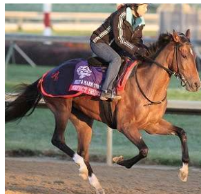
Perfect Shirl