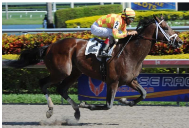
Chee