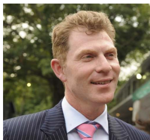
Bobby Flay