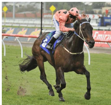
Australian superstar Black Caviar

During last year's six-week trial in Sydney's Federal Court, more than 30 witnesses from Australia, France,