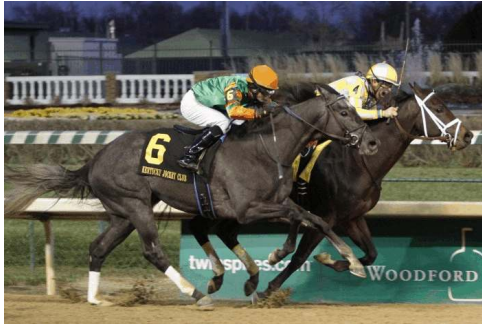
Frac Daddy (#6)