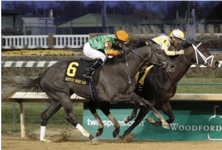
Frac Daddy (6) finishes second in GII Kentucky Jockey Club S.