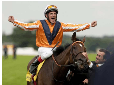
Danedream after her King George triumph