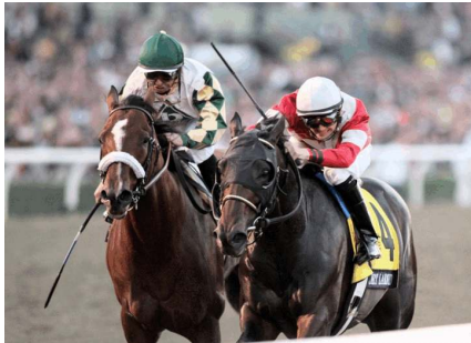
Mucho Macho Man (left) goes down bravely in the Breeders' Cup Classic

Reeves Thoroughbred Racing's Mucho Macho Man (Macho Uno), denied by the narrowest of margins by Fort Larned (E Dubai) in the GI Breeders' Cup Classic at Santa Anita Nov. 3, will make his 2013 debut in