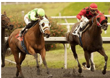
Reneesgotzip (rail) edges Nechez Dawn Benoit Photo