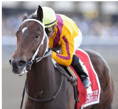
My Miss Aurelia