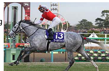
Gold Ship