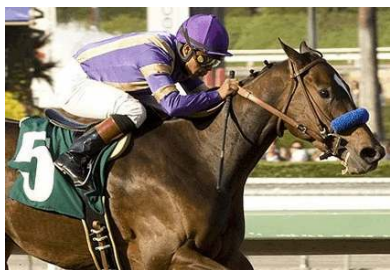
Mamma Kimbo

All carry 118 pounds, except My Miss Aurelia, 123.