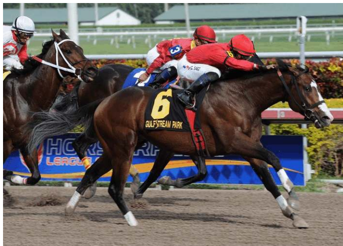
Indiano (Indian Charlie), bred in Kentucky and a champion in Panama, confirmed himself as a South Florida stalwart with his win in Saturday's GIII Mr. Prospector H. Coverage page 3