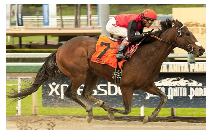
Avare