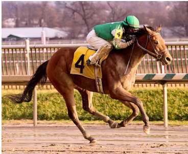
Alpha Mike Foxtrot

Winless since breaking his maiden at Delaware July 21, Alpha Mike Foxtrot was third in Laurel's James F. Lewis III S. Nov. 10 and runner-up in an optional