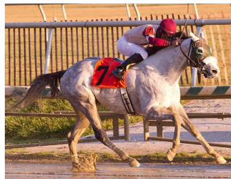
Il Villano

Il Villano, runner-up in the GII Hutcheson S. Feb. 11 and third in the GII Woody Stephens S. June 9, has enjoyed some of his best success in Maryland. The gray