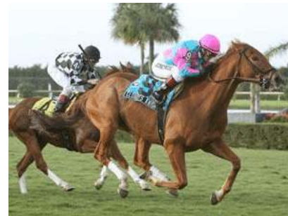
Lord Avie's leading money winner Cloudy's Knight