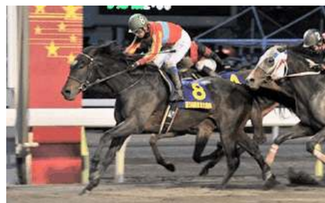
Roman Legend

Victoire Pisa (Jpn) (Neo Universe {Jpn}) and Transcend (Jpn) (Wild Rush) gave Japan an historic one-two finish in the G1 Dubai World Cup in 2011, and the country could be in line for another Meydan assault following the victory of Roman Legend (Jpn) (Special Week {Jpn}) in Saturday's G1 Tokyo Daishoten at Ohi Racecourse. The 4-year-old colt went on a six-race tear earlier this year, including a victory over Espoir City (Jpn) (Gold Allure {Jpn}) in the G3 Elm S. at Sapporo