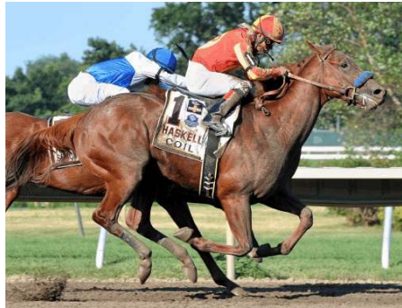
Coil dashes past Shackleford in the Haskell

Multiple Grade I-winning millionaire Coil (Point Given--Eversmile, by Theatrical {Ire}) enter stud in 2013 at