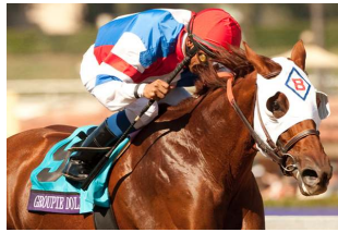
Groupie Doll