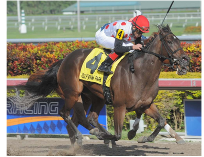
Successful Song

Successful Song last found the winner's circle in the Lighthouse S. at Monmouth June 30. She was runner-up in the Gil Molly Pitcher S. there July 29, third in the Lady Secret S. Sept. 3 and third again in Calder's Elmer Heubeck Distaff H. Nov. 10. The second choice here sat a reserved second off the pace set by Golden Mystery and chased down that foe in the stretch to take the lead in the shadow of the wire.