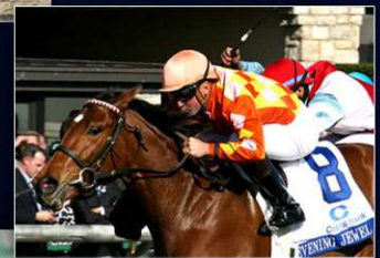
EVENING JEWEL Multiple G1 Winner & Eclipse Finalist