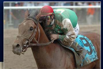
AFLEET ALEX Dual Classic Winner & Champion 3YO Male

8 GRADE ONE WINNERS 4 CHAMPIONS and 5 MILLIONAIRES