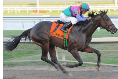
Itsmyluckyday in the Holy Bull