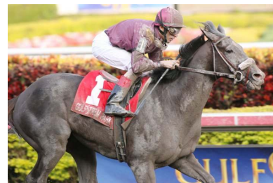
Jackson Bend