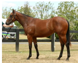
Lot 63

Lot 63's second dam is Twyla (Aus) (Danehill), a member of one of the Southern Hemisphere's most important sire-producing families. Twyla is a three-quarter sister to accomplished sires Redoute's Choice and Al Maher (Aus) (Danehill), and a half-sister to Hurricane Sky (Aus) (Star Watch {Aus}), Umatilla (NZ) (Miswaki), and Shantha's Choice (Aus) (Canny Lad