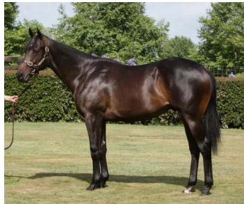
Lot 130, by O'Reilly

The HKJC signed for a total of three horses from Curraghmore, and two from Waikato Stud, including lot 130 , a brown colt by leading New Zealand sire O'Reilly (NZ), for NZ$460,000. The colt is out of the Centaine mare Escada (NZ), making him a full-brother to G2 Stan Fox S. winner Rare Insight (NZ), and a half to Australian champion older filly Glamour Puss (NZ) (Tale of the Cat), and G1 Doncaster H. winner Vision and Power (NZ) (Carnegie {Ire}).