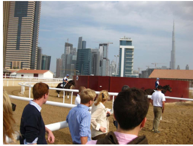
Trainees observe horses in training at Al Quoz