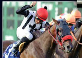
TEAKS NORTH Multiple G1 Winner & 2013 Sunshine Millions Turf winner

Afleeet - Nuryette, by Nureyev | $8,000 S&N