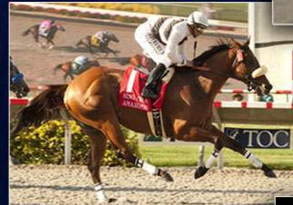
AMAZOMBIE Multiple G1 Winner & Champion Sprinter