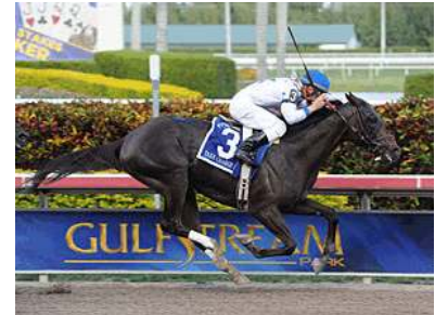
Take Charge Indy