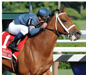
Ask The Moon