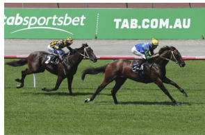
All Too Hard

His undefeated and world champion half-sister Black Caviar (Aus) (Bel Esprit {Aus}) is another week away from her return to action in the G1 Lightning S., but her half-brother All Too Hard (Aus) (Casino Prince {Aus}) returns to action in Saturday's G1 C. F. Orr. S. at the Melbourne oval.