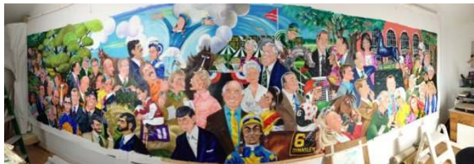
Peb Bellocq's NYRA Mural.....see p14-15