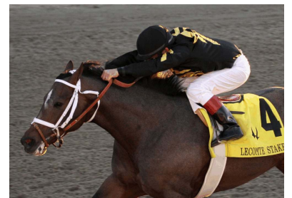
Oxbow