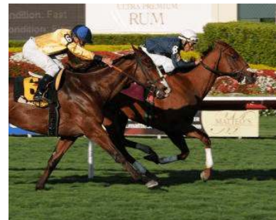
Speak Easy Gal winning at Gulfstream