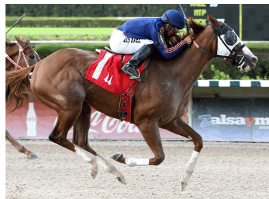
Beloveda