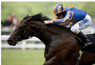
Await the Dawn Racing Post

This contest also features the return of Await the Dawn (Giant's Causeway), who is now conditioned by