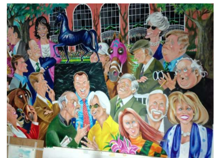
New York racing personalities

Ellen showed me a place at Aqueduct, and she told me it would be very possible to have the mural at the entrance [former Kelso Room, which is currently being renovated], which is magnificent. It's a big area, and it would emphasize the mural beautifully. I would have to do some changes emphasizing Aqueduct rather than Belmont."