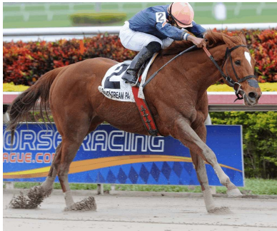
Golden Mystery