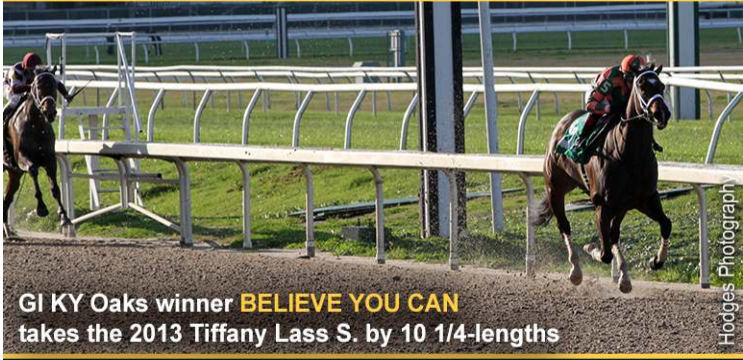
GI KY Oaks winner BELIEVE YOU CAN takes the 2013 Tiffany Lass S. by 10 1/4-lengths