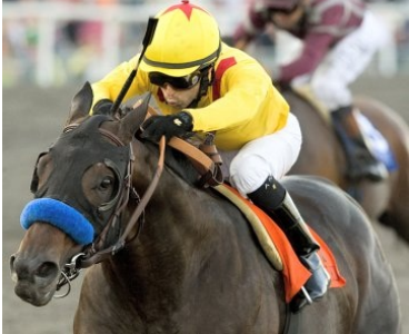
Richard's Kid

Richard's Kid (Lemon Drop Kid) will face a field of fourteen, including Interaction (Arg) (Easing Along), in Saturday's GII San Marcos S. at Santa Anita.