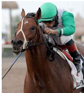
Csaba