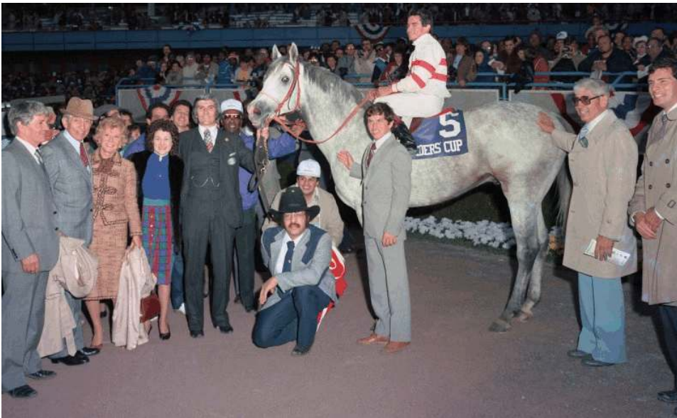
John Nerud and homebred Cozzene (*Caro) after the 1985 GI Breeders' Cup Mile