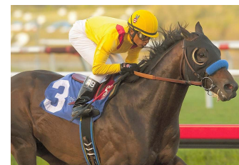
Richard's Kid