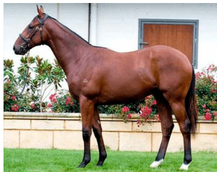
All Too Hard as a yearling

Unable to solve G1 Golden Slipper S. hero Pierro (Aus) (Lonhro {Aus}) in the G1 Sires' Produce S. last April and in the G3 Run to the Rose S. in September, he finally turned the tables on that rival, besting him by a half-length in the G1 Caulfield Guineas Oct. 13. He gave an outstanding account of himself when stretched to 2000 meters for the first time in the Cox Plate, missing by a neck to Ocean Park (NZ) (Thorn Park