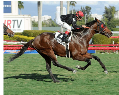
Point of Entry