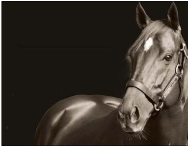
Flower Alley