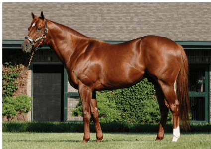
Speightstown