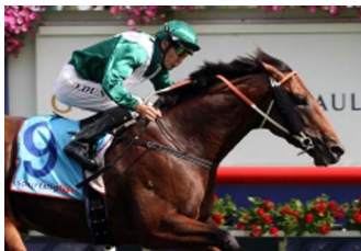
All Too Hard

A year after his half-sister Black Caviar (Aus) (Bel Esprit {Aus}) won the G1 C. F. Orr S. in her first attempt at 1400 meters, Vinery's All Too Hard (Aus) (Casino Prince {Aus}) kept the trophy in the family with a comfortable half-length victory. He was making his first start since finishing runner-up in the G1 Cox Plate over an extended 2000 meters Oct. 27.