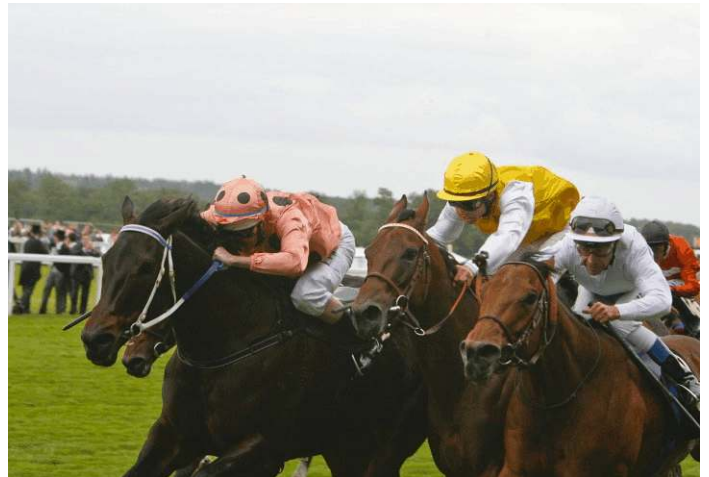
Black Caviar (salmon colors) at Royal Ascot