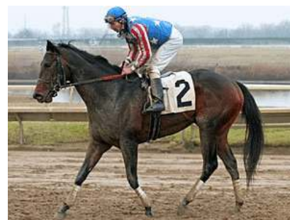
Officer Alex