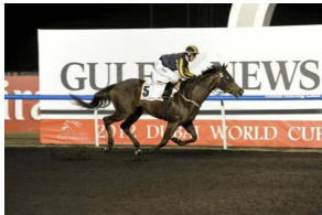
Krypton Factor

In addition to the G3 UAE 2000 Guineas, Meydan also plays host to the G3 Firebreak S. and G3 Al Shindagha Sprint. Barbecue Eddie (Stormy Atlantic), in arguably career form at age nine, looks to successfully follow-up on his last-out victory in the G3 Al Maktoum Challenge-R1, but he'll have to deal with U.S. Grade III winner Out of Bounds (Discreet Cat), who was an excellent runner-up first-up that evening. Krypton Factor (GB) (Kyllachy {GB}) went this close to winning the Al Shindagha in 2012, but went on to take the G1 Dubai Golden Shaheen two starts later. He faces a rematch here with Hitchens (GB) (Acclamation {GB}) and Aussie G1 winner Mental (Aus) (Lonhro {Aus}).