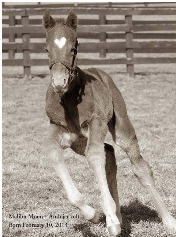
Malibu Moon – Andujar colt Born February 10, 2013

60 Broad St. Suite 100 Red Bank, NJ 07701 Fax (732) 747-8955 Phone (732) 747-8060 mediavista@aol.com