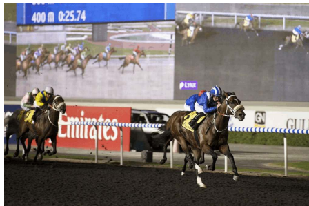
Soft Falling Rain

Sheikh Hamdan bin Rashid al Maktoum's Soft Falling Rain (SAf) (National Assembly) looks to maintain his undefeated mark as he faces seven fellow sophomores in the G3 UAE 2000 Guineas, one of three Group 3 tests tonight at Meydan. Purchased for just R350,000 at the Cape Premier Yearling Sale in 2011, the bay rattled off four wins in as many starts at home, capped