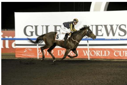
Krypton Factor

Last seen finishing sixth, beaten two lengths behind Black Caviar (Aus) (Bel Esprit {Aus}) in the G1 Diamond Jubilee S. June 23, Krypton Factor (GB) (Kyllachy {GB}) returns to the scene of his finest hours for tonight's G3 Al Shindagha Sprint S. Beaten a nose when runner-up to Hitchens (Ire) (Acclamation {GB}) 12 months ago, the dark bay turned the tables on that rival in the G3 Mahab al Shimaal S. Mar. 10 and defeated Rocket Man (Aus) (Viscount {Aus}) by a decisive 2 1/4 lengths in the G1 Dubai Golden Shaheen three weeks later. He was unplaced in the G1 KrisFlyer International Sprint in May prior to his effort at Royal Ascot. Mental (Aus) (Lonhro {Aus}) may not be in the same league as Black Caviar, but is an accomplished sprinter at home. Runner-up in the G1 Manikato S. Oct. 26, he scored a breakthrough victory in the G1 Patinack Farm Classic at Flemington Nov. 10 and makes his first start since.