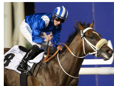
Soft Falling Rain

Boasting a perfect record in South Africa that earned him champion juvenile honors last term, Soft Falling Rain's campaign culminated in an impressive display in Turffontein's G1 SA Nursery in April. He had advertised his class with another facile score in the seven-furlong UAE 2000 Guineas Trial last time Jan. 17, and had no trouble maintaining his unbeaten streak here.