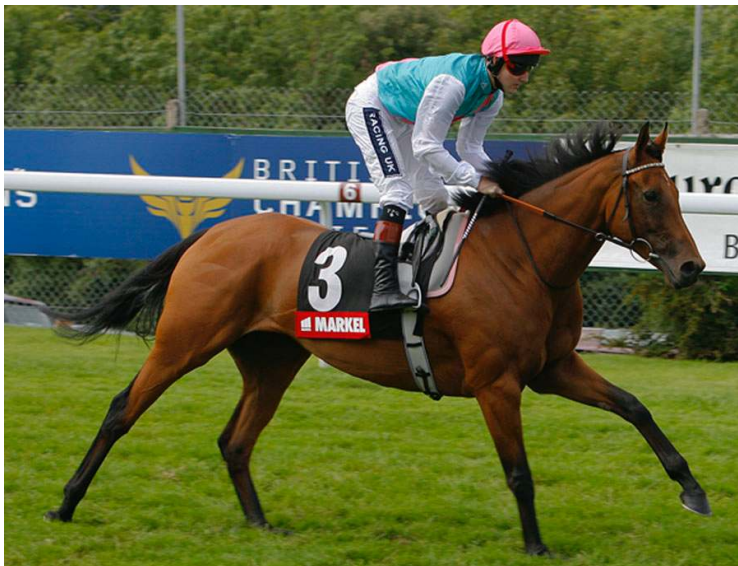
Juddmonte announced that their homebred six-time Group/Grade 1 heroine Middy (GB) (Oasis Dream {GB}) will be the first to be covered by Frankel (GB) (Galileo {Ire}). The 7-year-old recently produced her first foal, a colt by Galileo