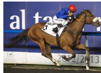
Moonwalk in Paris

An improver in the mile division last term in his native France, Moonwalk In Paris made his initial foray into black-type company a successful one when annexing the G3 Prix Edmond Blanc at Saint-Cloud in April. Runner-up after a break in the G3 Prix du Chemin de Fer du Nord at Chantilly in mid-June, the bay ran third in the G3 Prix Messidor at Maisons-Laffitte the following month and was