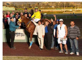
A Jealous Woman and connections