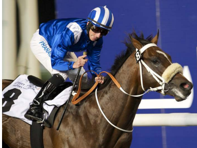
Soft Falling Rain

Sheikh Hamdan bin Rashid al Maktoum's Soft Falling Rain (SAf) (National Assembly) increased his unbeaten streak to six-for-six with a decisive 2 1/4-length tally in Meydan's G3 UAE 2000 Guineas yesterday.