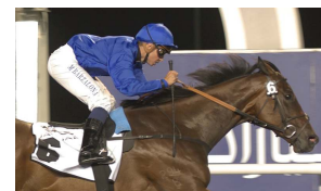
Mental A Watkins/DRC

"The surface was a query, but he handled it well."