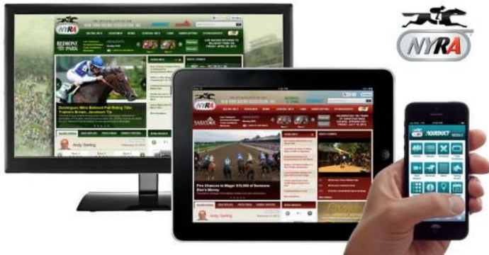
The new NYRA.com