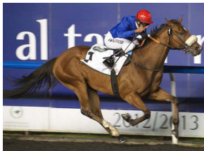
Moonwalk in Paris

Godolphin scored a pair of Group 3 successes in Dubai Thursday--French Group winner Moonwalk in Paris (Fr) (Oratorio {Ire}) capped a one-two finish for the boys in blue in the Firebreak S.; while Australian G1SW Mental (Aus) (Lonhro {Aus}) overcame a tardy start in the Al Shindagha Sprint.