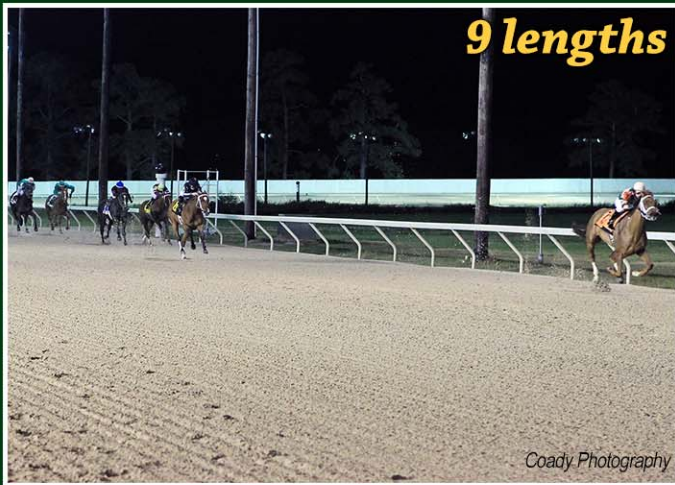
DANCINGINTHECIRCLE takes the $100,000 By The Light S.