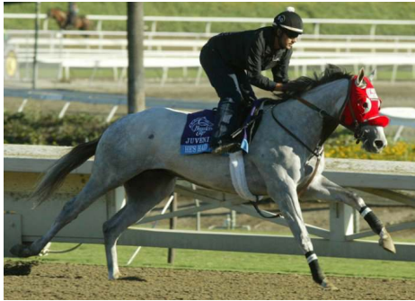
He's Had Enough