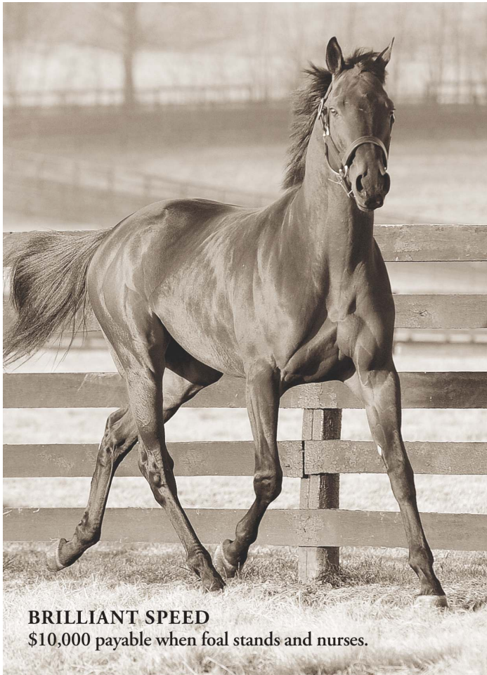
BRILLIANT SPEED $10,000 payable when foal stands and nurses.