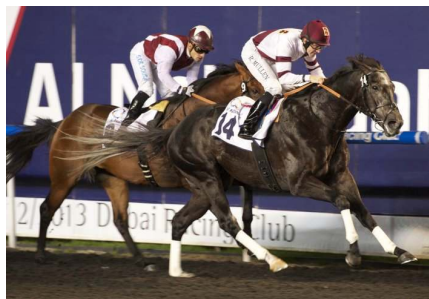
Unbridled Ocean

UNBRIDLED OCEAN (h, 5, Unbridled's Song --Ocean Drive {MGSW-US, $803,986}, by Belong To Me ), a $875,000 KEESEP yearling, had shown abundant promise for the Todd Pletcher stable at three, but had raced only once since 2011 when fifth in a seven-furlong allowance optional claimer at Belmont last October. Forced to race three-wide early staying close to the