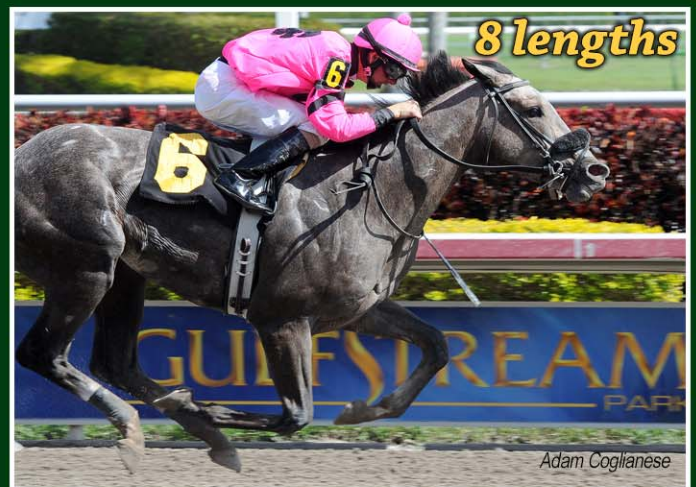
Stakes-Placed DIVINE AMBITION aired in his MSW career debut

His 1st Crop Are Showing His Brilliance And He's Just Getting Started