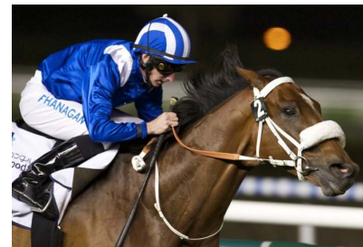
Mushreq

Rebounding from a latest seventh in the G2 Al Maktoum Challenge Round 2 on the Tapeta Feb. 7, Mushreq stamped his authority on this important Carnival staging post to register an impressive first Pattern-race success. Just shy of the very best in his native South Africa, the bay was runner-up in the G1 Golden Horseshoe as a juvenile and fifth in the G1 Cape Derby at Kenilworth last January. On his third start at Meydan, he had registered a win in a 10-furlong handicap on the turf Jan. 31 before his flop on the artificial surface in the Maktoum Challenge. Breaking well on this occasion, he was restrained to race in mid-division by a confident Paul Hanagan early. Unleashed in mid-stretch, he took total command with a furlong to race en route to a convincing defeat of his stable's stalwart Master of Hounds. "He absolutely loves dropping in like that and passing them," Hanagan commented. "He's improved with every run and they went a nice gallop." Mike de Kock added, "He's been a real revelation in the Carnival, and the harder we've been on him, the better he's got. We always rode him handy and one day we got stuck behind in error and flew home and a light went on in my head then so the change of tactics has helped. He's actually got me baffled and the next step is to get him into the Mar. 30 G1 Duty Free. Master of Hounds surprised me more than any, as I thought he'd get tired, but he was gutsy and stayed there."