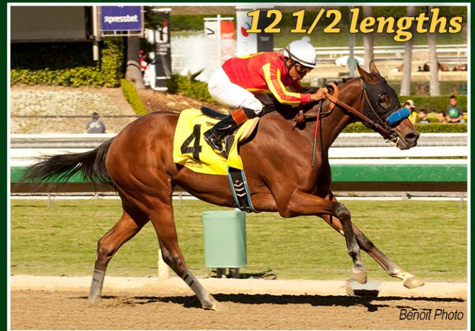
GI-Placed TDN Rising Star BLONDE FOG winning her MSW debut