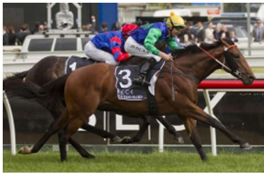
All Too Hard

Tonight's G1 Futurity S. at Caulfield has attracted a top group of consistent gallopers, as well as a few budding stars. All Too Hard (Aus) (Casino Prince {Aus}) has always been a horse to watch--thanks to his famed elder sister Black Caviar (Aus) (Bel Esprit {Aus})--but the 3-year-old has now carved his own reputation, establishing himself as one of the world's most sought-after racing and stallion prospects. He earned his breakthrough victory