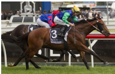
All Too Hard