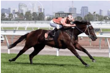
Black Caviar

The undefeated 6-year-old, who last weekend won her 23rd race with a track record-setting performance in the G1 Black Caviar Lightning S. at Flemington ( video ), becomes just the second horse to be inducted to the Hall of Fame while still in training. The other was dual G1 Cox Plate heroine Sunline (NZ) (Desert Sun {GB}), who received the honor in 2002.