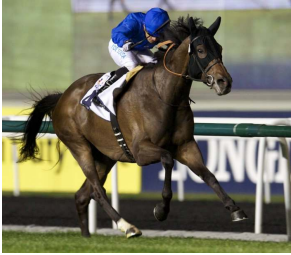
Sajjhaa

All eyes were on South African Horse of the Year Igugu (Aus) (Galileo {Ire}) in yesterday's G2 Balanchine at Meydan, but it was Sajjhaa (GB) (King's Best) who got the money with a one-length tally over Prussian (GB) (Dubai Destination). One of Godolphin's European stalwarts among the distaff brigade in recent years, Sajjhaa had a sole Pattern-race success to her name before the start of 2013 in the G3 Premio Sergio Cumani at the San Siro as a sophomore. The runner-up in