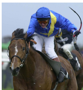
Holding Court

Hammond as a 5-year-old. The winner of seven of his 21 lifetime starts, he scooped the now-defunct G1 Prix Lupin in 1993, a month before his finest hour in the French Derby. Also runner-up in the 1994 G1 Prix de l'Arc de Triomphe and placed in the following season's G1 Turf Classic Invitational and G1 Japan Cup, he retired with the highest stakes-winning tally of any colt in Europe to that date.