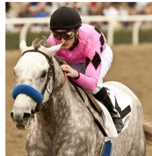
Flashback