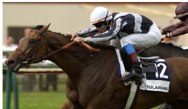
Sulamani