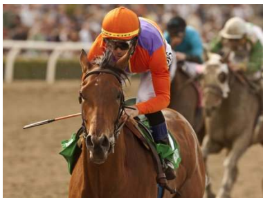
Beholder

Champion 2-year-old filly and GI Breeders' Cup Juvenile Fillies heroine Beholder (Henny Hughes), unbeaten GIII Rachel Alexandra S. heroine Unlimited Budget (Street Sense) and GI Hollywood Starlet S. victress Pure Fun (Pure Prize) top the list of 120 early nominations for the 139th running of the GI Kentucky Oaks.