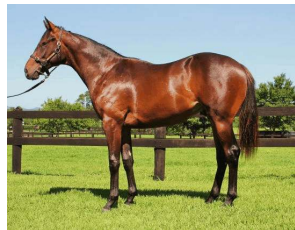
Lot 365 inglis.com.au

The third and final day of Session One of the Inglis Melbourne Premier Yearling Sale concluded Tuesday at the company's Oaklands complex and featured a broad base of international competition for the top offerings.