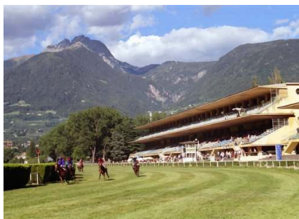
Malinka's favorite course: Meran in Italy

This number includes harness tracks and very small courses, which in Germany we call C-class racetracks, and in Australia they call picnic meetings. In the UK and Ireland they have point-to-point races--steeplechases ridden by amateur riders under special rules--and in the Netherlands