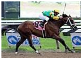
Palace Malice