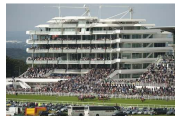
Epsom Downs

You may wonder why I have not visited many racecourses in the UK. I have never been to the world-famous Ascot, and never to the most important jumps tracks, Cheltenham and Aintree. England is the motherland of racing and not far from Germany, but I do not really like it for a few reasons. Cont. p9