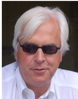
Bob Baffert Sherackatthetrack