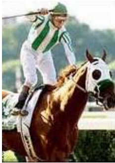
Gary Stevens and Point Given winning the 2001 Belmont