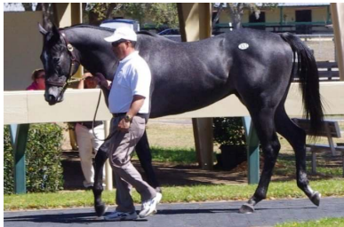
Hip 333 LM

"Really good horses deserve to sell for that much," said an elated Reyes while taking a break from a BBQ celebration back at the barn. "Everybody that picks out good horses was on him. As the sale progressed, I knew that he'd bring over a million dollars based on who was looking at him. He made my job very easy. All you needed to do was treat him right--he was a very simple horse to train. He was a big kid that was a little bit overweight as a yearling. But I could tell that he'd be very good-