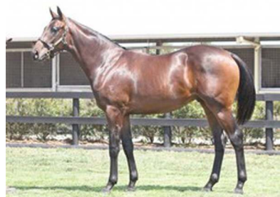
Lot 352 Magic Millions