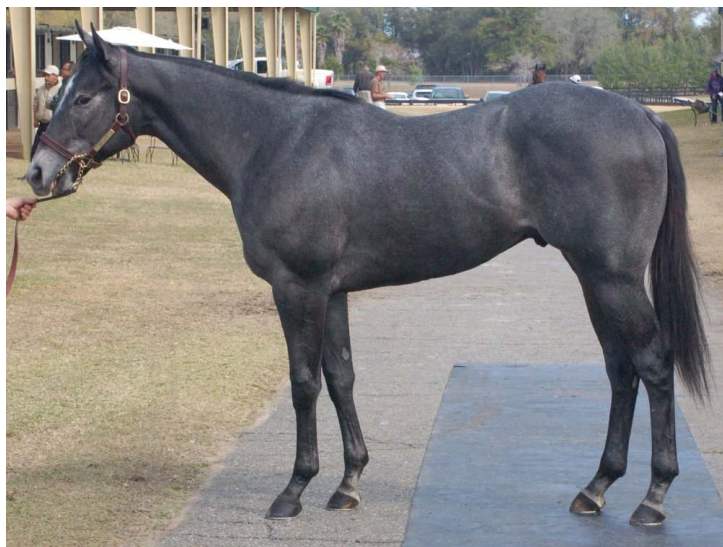
2013 OBSMAR Topper by Smart Strike Sherackatthetrack