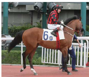
Frederick Engels