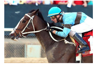
Tiz Miz