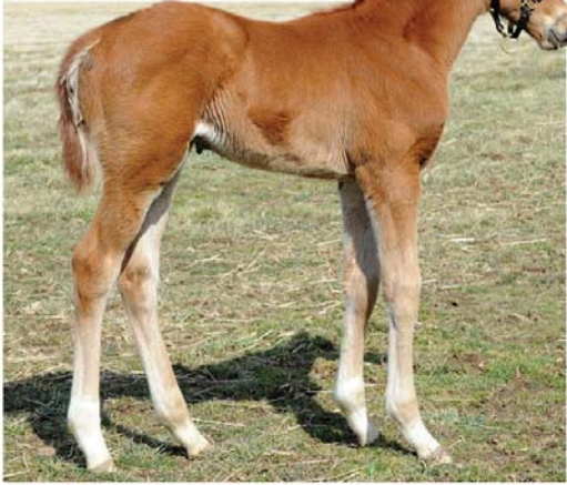
out of Lawanda

...by Candy Ride's Most Brilliant G1 Son