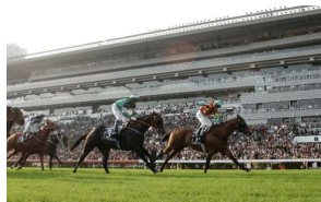
Ambitious Dragon bests Glorious Days in the Hong Kong Mile