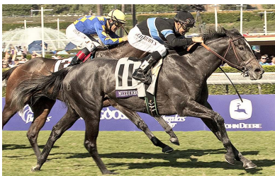
Mizdirection