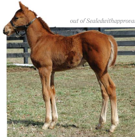
out of Sealedwithapproval