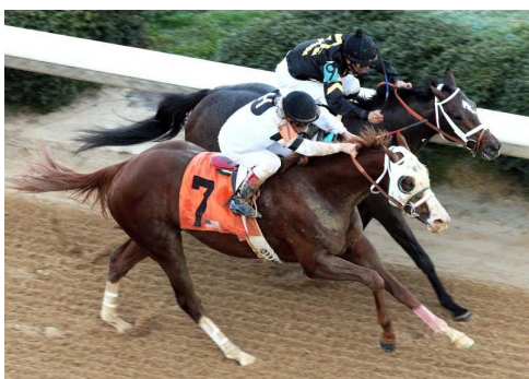
Will Take Charge (outside)

Will Take Charge, a son of the talented racemare Take Charge Lady (Dehere), graduated at second asking at Keeneland last October. A well-beaten 13th in the GII Kentucky Jockey Club S. at Churchill Nov. 24, he