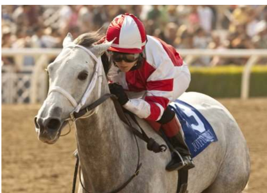
Joyful Victory