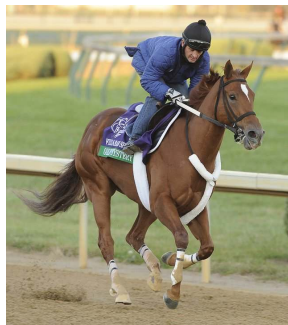
Golden Mystery

The 7-year-old Golden Mystery (Awesome Again) headlines today's GI Inside Information S. riding a two-race winning streak. She closed out her tenure for Farnsworth Stables LLC with a win in the Florida Sunshine Millions Filly and Mare Sprint S. Jan. 19, and following a $625,000 winning bid by Regis Farms at FTKFEB, rolled to another sharp victory in the Gill Hurricane Bertie S. Feb. 10. Aubby K (Street Sense), a runaway optional claiming winner over this course last March, kicks off her 4-year-old campaign here. Third in the GI Acorn S., she was last seen finishing a non-threatening eighth in the GI Test S. Aug. 25.