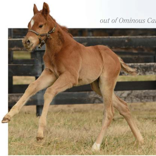
out of Ominous Cat