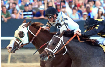
Will Take Charge (outside)

D. Wayne Lukas hadn't won the GII Rebel S. since 1989, but the Hall of Famer meant business in Hot Springs yesterday, saddling the first two finishers in this year's renewal. Will Take Charge (Unbridled's Song), a winner of the Smarty Jones S. two back Jan. 21, was the far less-heralded member of the Lukas charge at 28-1, but he came flying late to best forwardly placed Oxbow (Awesome Again) in