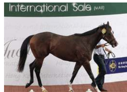
Lot 13 HKJC.com

EXCEED AND EXCEL GELDING TOPS HKIS The Sha Tin parade ring played host to part two of the Hong Kong International Sale, and it was a well-related gelding by top sire Exceed and Excel (Aus) who led the way on a final bid of HK$6.2 million (US$799,484).