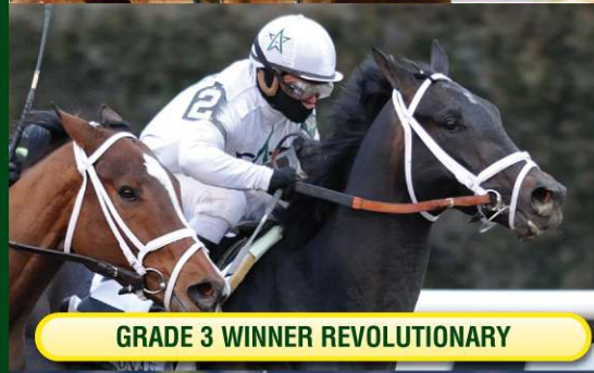
GRADE 3 WINNER REVOLUTIONARY