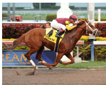
Discreet Dancer A Coglianese

When Darley spent an estimated $200-million acquiring stallion prospects for the 2008 season (first crop 2009), this is the result they were after: if you click here to view the TDN 2013 Third-Crop Year-to-Date Sire List, the top four names are all horses Darley scooped up, mostly in its 2007 stallion prospect spending spree. The current third-crop leader was an earlier acquisition: they bought Discreet Cat (Forestry) privately after he broke his maiden at Saratoga as a