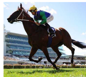
All Too Hard

All Too Hard (Aus) (Casino Prince {Aus}), the half-brother to 13-time Group 1 winner Black Caviar (Aus) (Bel Esprit {Aus}), will make his next start in the G1 All-Aged S. at Randwick Apr. 27, it was announced yesterday. The 3-year-old, winner of the G1 C. F. Orr S. and G1 Futurity S. in two starts this preparation, was scratched from the G1 Australian Guineas the morning of that Mar. 2 event after spiking a fever and has maintained a low profile since. Plans call for All Too Hard to resume training this week, and he is likely to trial at Flemington