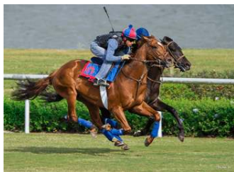
Animal Kingdom