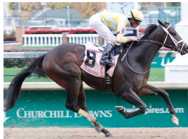
Uncaptured