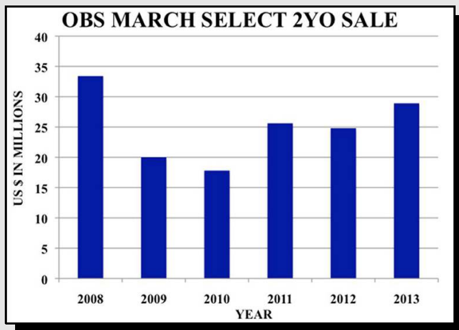
OBS MARCH SELECT 2YO SALE

"The OBS Two-Year-Old Sale last week recorded solid gains in the high 'teens in both gross and average, and the prospects of getting your horse sold improved to slightly above the 50-50 mark. Combined with Barretts, the two sales have improved by 57% in gross and 52% in average from their 2009-2010 bottoms, and the combined average, though with 21% fewer sold, is actually higher than in 2008." — Bill Oppenheim