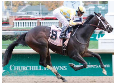
Uncaptured