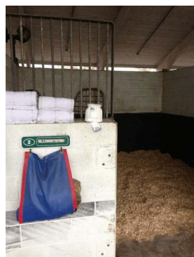
Animal Kingdom lies empty following his departure for Dubai