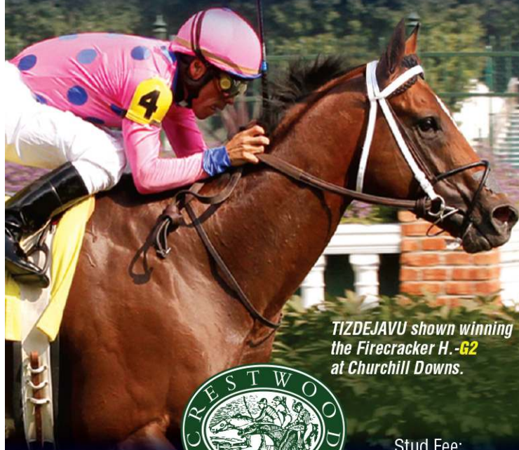
TIZDEJAVU shown winning the Firecracker H. -G2 at Churchill Downs.