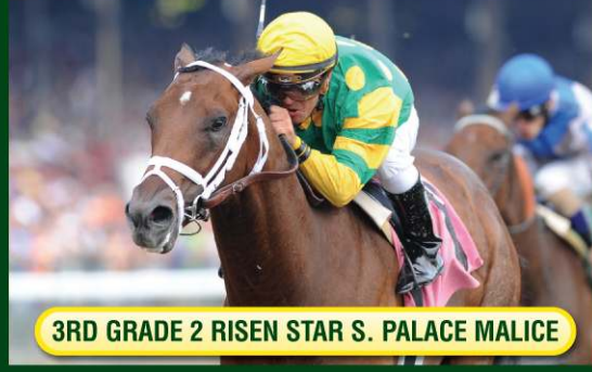
3RD GRADE 2 RISEN STAR S. PALACE MALICE