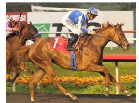
Pure Fun