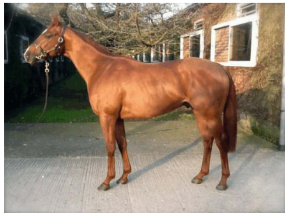
Kitten On the Run