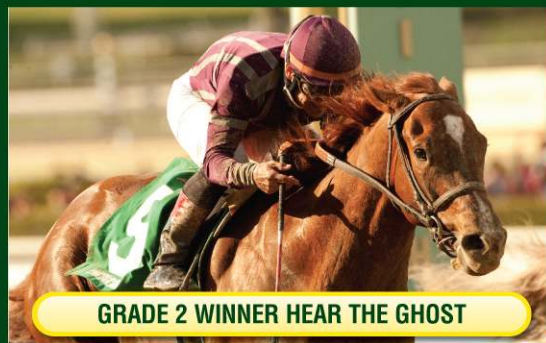
GRADE 2 WINNER HEAR THE GHOST