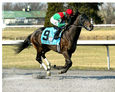
Crop Report