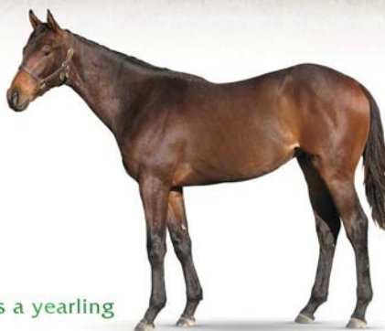
as a yearling