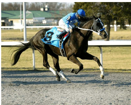
Black Onyx

Possessed of an either/or sort of pedigree, Black Onyx was ticketed for the turf for each of his first two career starts, but each time, the race was washed onto the main track. A debut second in a modestly rated affair at Belmont Oct. 11, the dark bay broke his maiden going Aqueduct's one-turn mile Nov. 11 before heading south for the winter. Fourth, but beaten 19 lengths in a main-track allowance won by Bradester (Lion