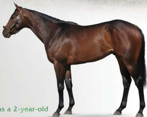
as a 2-year-old