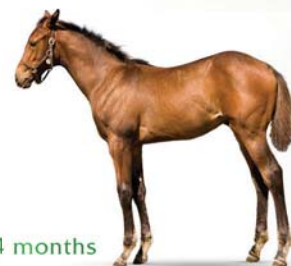
at 4 months