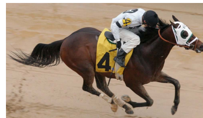
Laurie's Rocket

Click for the brisnet.com chart or VIDEO.