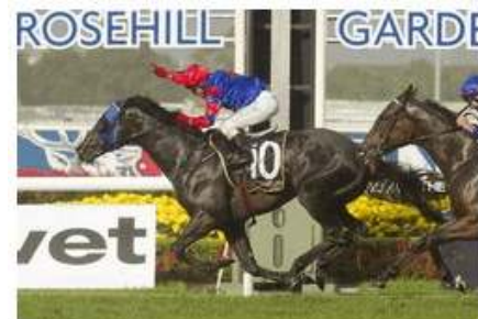
Pierro