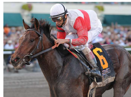
Orb