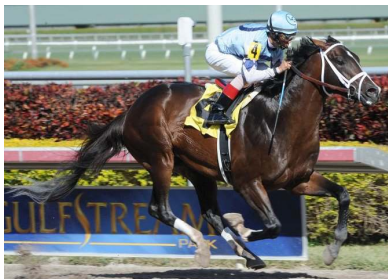
Verrazano

★ "TDN Rising Star" ★ Verrazano (More Than Ready) turned in his final morning drill at Palm Meadows yesterday before he puts his undefeated record on the line in Aqueduct's GI Wood Memorial S. Saturday. Working in company with stablemate Discreet Dancer (Discreet Cat), who will contest the GI Carter H. on the Wood undercard, Verrazano was clocked in a fastest-of-17 1:01.17 for five furlongs.