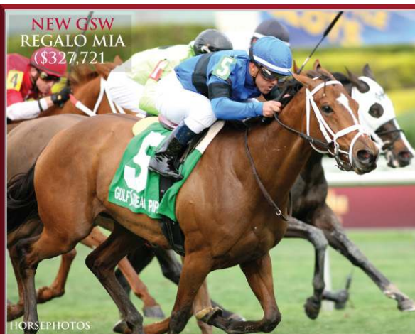
NEW GSW REGALO MIA ($327,721)