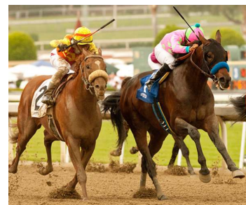
Liaison (inside) holds on