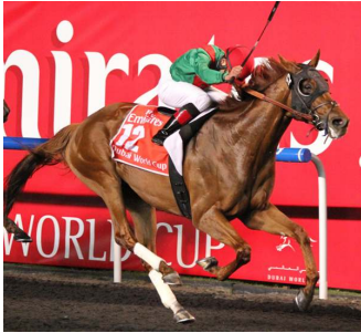
Animal Kingdom