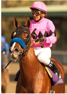
Power Broker