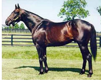
Slew City Slew