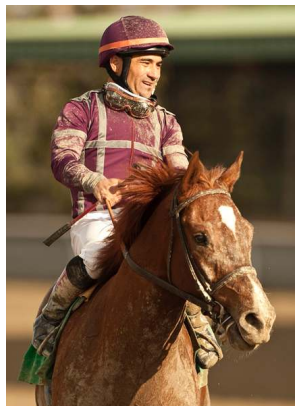
Hear the Ghost