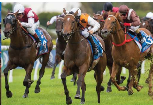
Overreach by Exceed And Excel leads a one-two-four for her sire in the world's richest juvenile race.