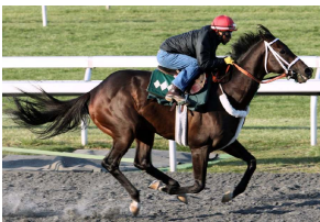
Ryduilluc during his workout Saturday