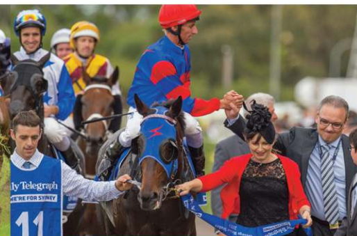
Pierro by Lanhro notches up his fifth G1 win – and his 11th from 13 starts! – in the George Ryder.