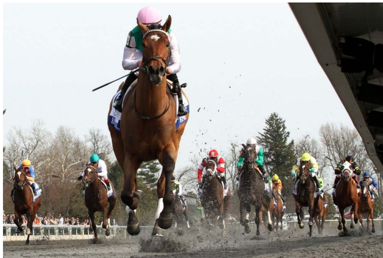
Emollient leaves the field behind in the GI Ashland S.