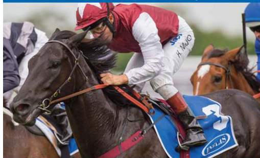
Appearance by Commands wins her third G1 of the season, the Queen Of The Turf.