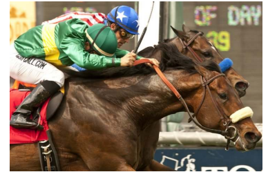
Fed Biz (Inside) and Battle Force at the wire

Battle Force completed the trifecta in the GIII Generous S. in Nov. 2011 in his first start against winners before taking a year-long hiatus. The Woodford colorbearer returned to finish second in an off-the-turf allowance at Betfair Hollywood Park Nov. 17 and came back with another runner-up effort in the GII Beaufort S. over this course and distance Dec. 26. Battle Force broke from the inside post here and was content to rate off the pace as favored Fed Biz led the way. He steadily improved his position into the turn and swung four wide entering the lane. The chestnut dug in and rallied to catch Fed Biz late. Click for the brisnet.com chart or VIDEO .