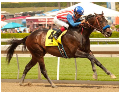
Declassifiy Benoit Photo

Declassify RNA'd for just $8,500 as a weanling at the 2010 Keeneland November sale, and went for $17,000 to Preston Stables at Fasig-Tipton's Kentucky Fall Yearling Sale.