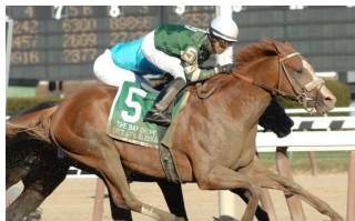
Declan's Warrior

Declan's Warrior, a last-to-first debut winner at 34-1 at Belmont last October, kicked off his sophomore campaign with a second-place finish, beaten only a neck, in a Gulfstream optional claimer Feb. 9. He dead-headed with subsequent GI Florida Derby fourth Narvaez (Holy Bull) in a $75,000 optional claiming win in Florida Mar. 9, and was a bit overlooked at the windows for his stakes debut here.