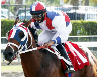
Sr. Quisqueyano

Sr. Quisqueyano was victorious in his first three career starts at Calder last summer, including a 13 3/4-length Seaciff S. win Aug. 25. However, he was winless in his last six efforts, finishing eighth in the GIII Holy Bull S. Jan 26 and seventh in the GII Fountain of Youth Feb. 23 in his latest starts. The chestnut broke from the inside and set the pace along the rail. He was challenged by favorite Speak Logistics, but couldn't quite