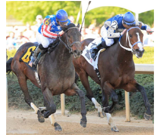
Officer Alex (outside) and Bob Cat Jim in the stretch