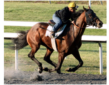
Dewey Square during his breeze Saturday