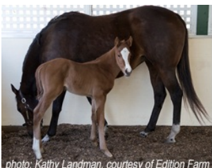
Filly o/o Wanda Nevada