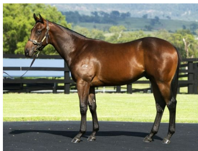
Lot 295 inglis.com.au

The Inglis Easter Sale resumed for the second session at the Newmarket sale complex on Wednesday with a regular sale beat after the intense interest of Tuesday's A$5-million Redoute's Choice (Aus) colt. However, Coolmore's Fastnet Rock (Aus) charged things up again halfway through the session when Emirates Park Stud determinedly maintained the bidding advantage to secure lot 295 , a bay colt by the sire out of River Dove (Aus) (Hurricane Sky {Aus}) from the draft of