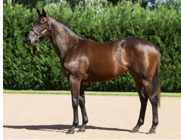
Fastnet Rock-Mani Bhavan filly