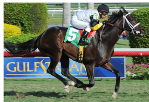
Rydilluc