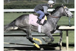
On Fire Baby