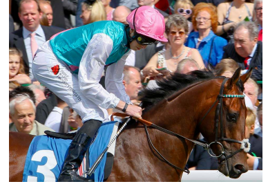
Dundonnell